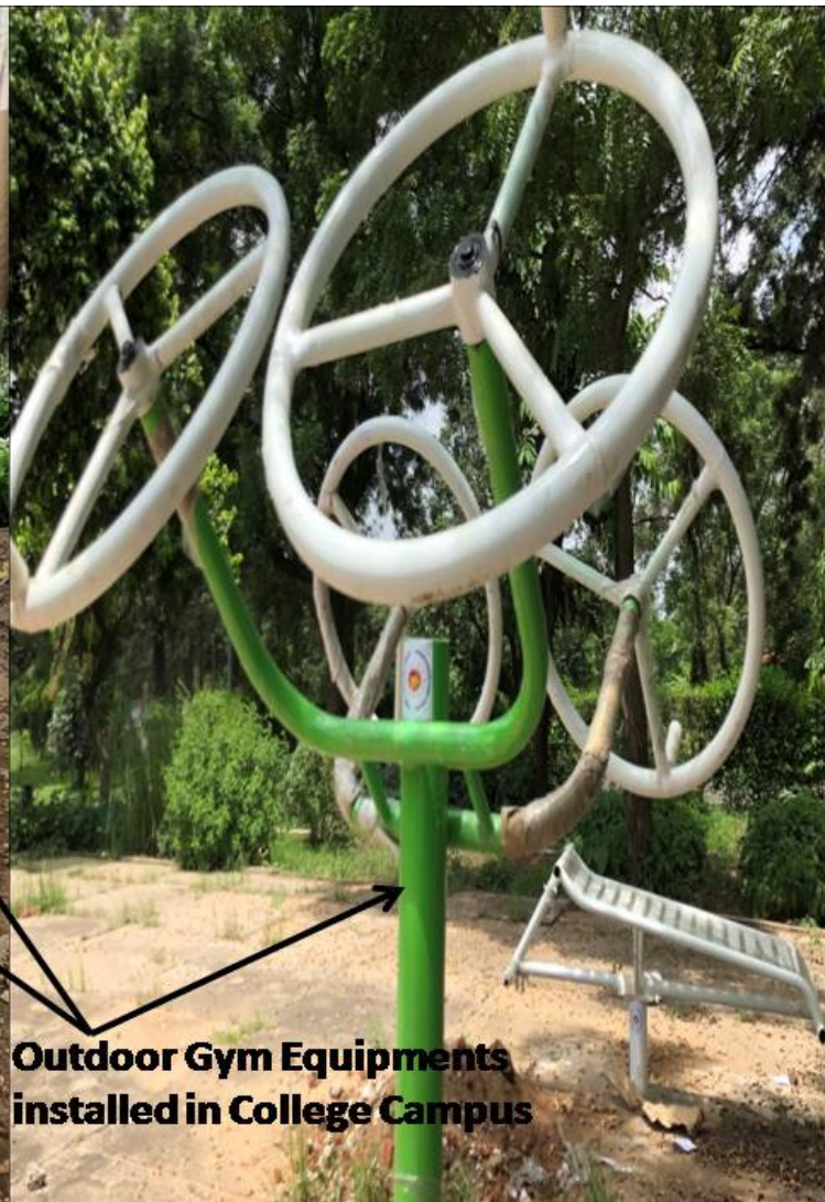
Outdoor Gym Equipments installed in College Campus