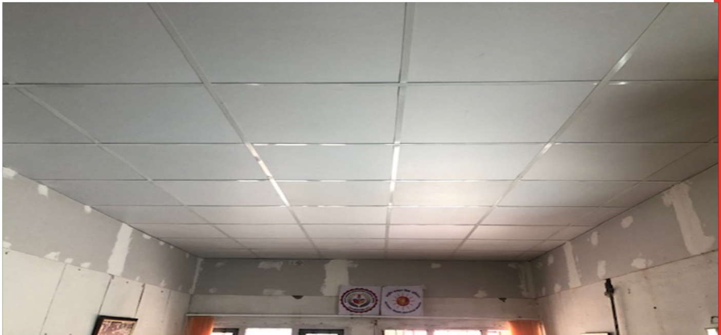
ROOM NO 210