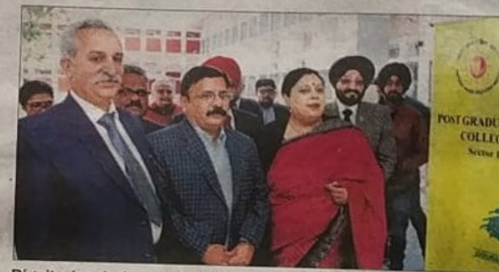
Dignitaries during the inauguration of projects at the PGGCG in Sector 11, Chandigarh, on Tuesday.