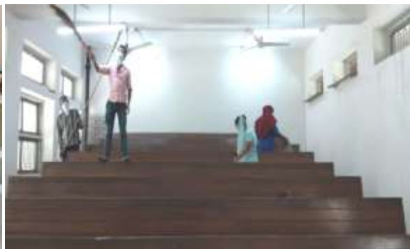
Sanitation and Fumigation of Canteen Sanitation and Fumigation of Classrooms