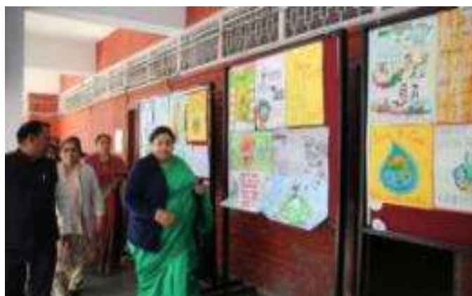
Chief g\Guest and Principal Ma'am Viewing Posters and Slogans