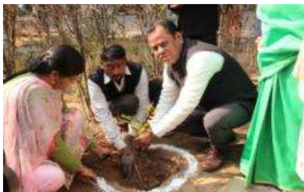
Tree plantation by Chief Guest, Principal and Faculty Members