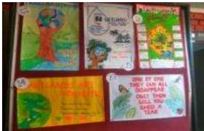
Display of Posters and Slogans made by Students