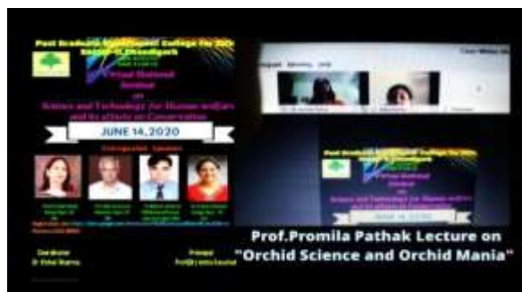
Brochure of the Event