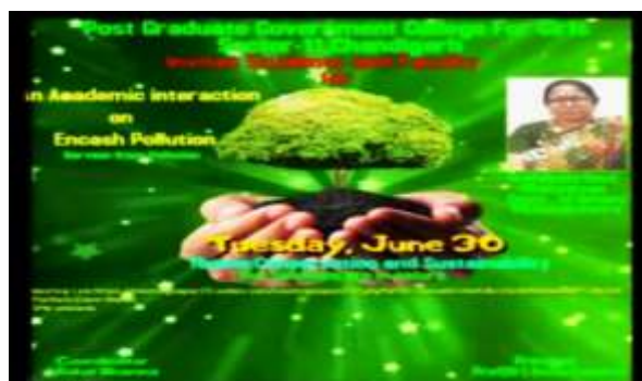
Brochure of the Event