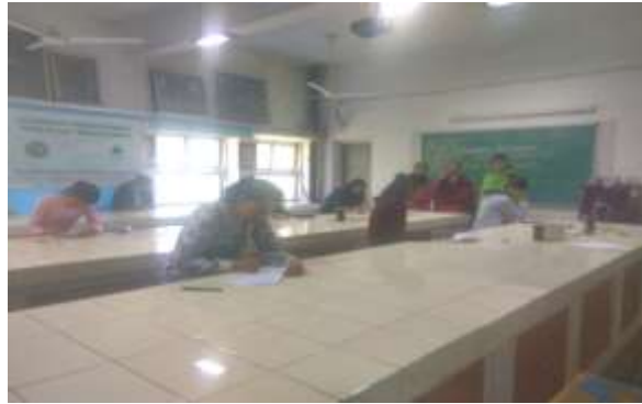
Students participating in Essay Writing Competition