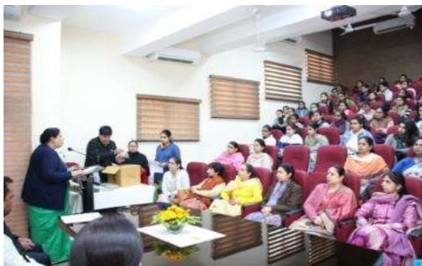
Principal Ma'am addressing the students and Faculty Members