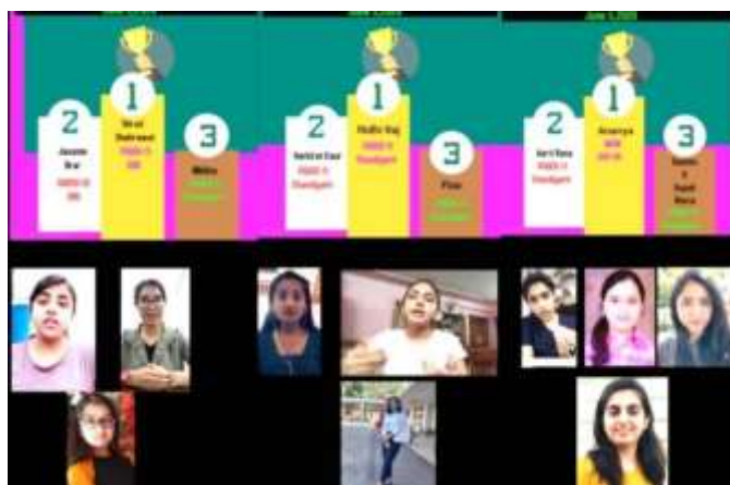
Result of Inter-College Declamation Competition

Botany Department of Grade 'A' accredited with CGPA 3.52 Post Graduate Government College for Girls. Sector 11, Chandigarh organized an Inter-College Declamation contest on 5 th and 6 th June, 2020 on research oriented scientific topics i.e. Artificial intelligence, Artificial trees, recombinant DNA, Ozone, which are of immense importance in present Covid era. Declamation competition helps to enhance participant diction, stage presentation skills and boost their confidence. The competition was held in Undergraduate and Postgraduate categories. Around 100 participants of five different colleges of Chandigarh, DAV-10, PGGC-11, PGGCG-11, MCM DAV-36 and SD college took part in completion and they are assessed at different levels before the final of the event which is held for two days ( 5 th and 6 th June, 2020 ) on the eve of Environment-day.