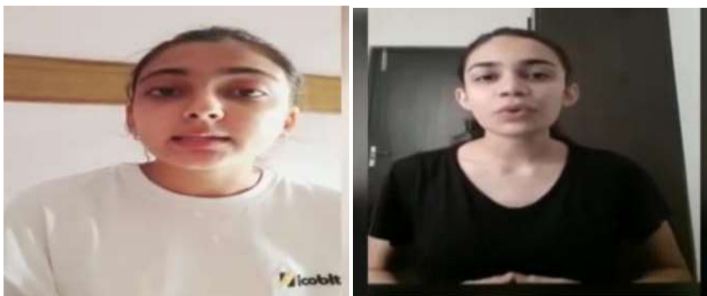
Students participating in Intra-College Declamation Contest

Botany department organized declamation contest on topic “To facilitate parallel study on impact of 1918 Spanish pandemic and Covid-19 with mitigation measures adopted to control pandemics on 20 th September,2020 in which more than hundred UG and PG students participated. Declamation helps to enhance participant diction, stage presentation skills, boost their self-confidence and public speaking skills. The participants gain valuable skills that will serve them well in the years and decades ahead. The declamation competitions offer a chance for participants to gain substantial experience, evaluate outcomes and a great platform to display knowledge and skills amasses over a years.