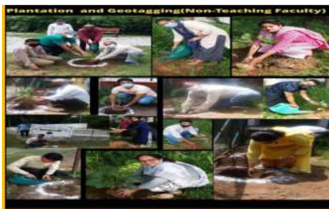
Plantation and Geo-Tagging by Non-Teaching Faculty