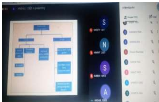
Colloquium Series 4