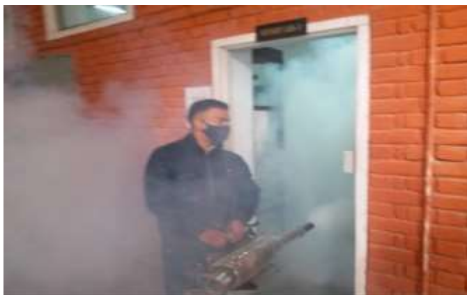
Fumigation in Class Rooms