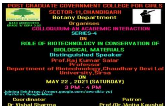
Brochure of the Event