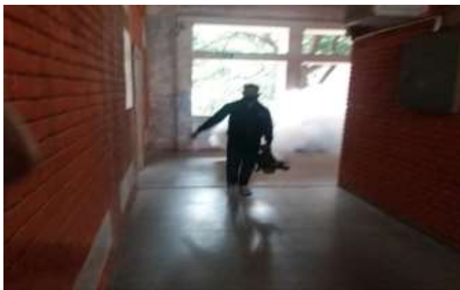
Fumigation outside the Departments