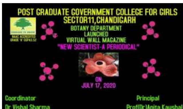
Cover page of Virtual Wall Magazine

Botany Department, Post Graduate Government College for Girls, Sector 11, Chandigarh, launched a Virtual wall magazine “New Scientist-a periodical, on 17 th July, 2020. It is an integral part of Botany Department, where students refresh their knowledge with recent findings and express their skills posting articles. “New Scientist-a periodical”, an extraordinary window for learning opened the doors of creativity and nurtured students’ imaginations and give wings to young girls to soar the sky. It provides a beautiful medium to enable the students to express their internal feelings, developing positive and desirable qualities and learn writing skills. The main objectives of mobilizing virtual wall magazine in this COVID-19 era is to reflect the identity of education institute and provide a wonderful platform for these young potential ones to show case their talent and express themselves into a conglomeration in COVID-19 era and to initiate community outreach, pupil-teacher interaction and provide forum to communicate opinions, ideas and information of students activities-an excellent community outreach.