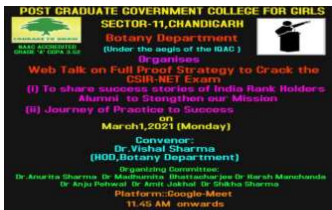
Brochure of the Event

A web talk was organized on 21 st March, 2021 to apprise the students of various strategies to crack CSIR-NET. In this event, alumni of the college who were able to crack CSIR-NET were invited. They interacted with the students and answered their queries. The main inferences of the Alumni talk were: Time Management Skills, Practice Mock Tests, Positive Attitude, Examination Analysis and Clear Concepts. The practice of going through previous UGC NET Examination papers and tries to analyze the frequency or the pattern of repeating questions/concepts, as this to be useful for most students. Approximately 40 PG students along with 5 teachers attended the talk.