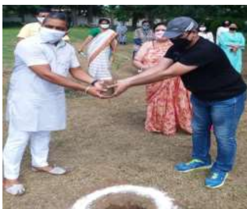
Tree plantation by Sarpanch Dhanas Village