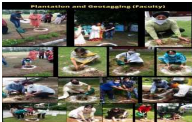
Plantation and Geo-Tagging by Teaching Faculty

Van Mahotsav is an annual tree plantation movement in India celebrated on 16 th July, 2020 to create awareness about the bad effects of deforestation. Botany Department, Post Graduate Government College for Girls, Sector11, Chandigarh, is taking initiative to organise “Regional Campaign on Plantation and Geo-tagging” with a theme “If you plant a tree, you plant a life”. The objective of campaign is to encourage community outreach and to raise public awareness on environmental pollution and plant conservation. The pioneer campaign witnessed massive public support and cooperation; around 400 people from Chandigarh, Delhi, Haryana, Himachal and Punjab participated, belonging to different strata of society ranging from, businessmen, doctor, lecturers students and housewives. The main aim of Geo-tagging plantation is preservation of nature and eco-restoration, a best gift to society.