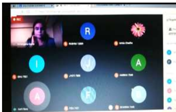
Colloquium series 3 on Climate change and Carbon Footprint