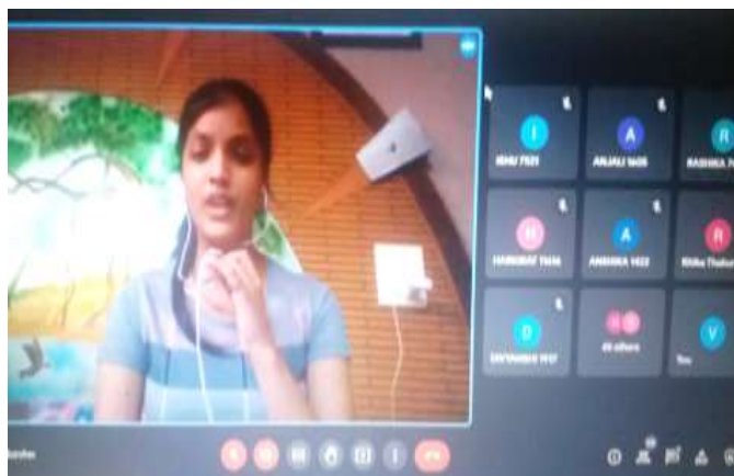
Intra college Declamation contest