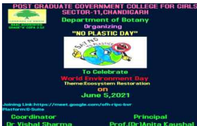
Brochure of the event

Botany Department of Post Graduate Government College for Girls, Sector-11, Chandigarh, celebrated Environment Day on 5 th June, 2021 by organizing 'No Plastic Day-Be part of the Solution' by taking initiative on this day to make campus plastic free on every Saturday. For this a poster making competition was organized in which about 100 students participated with enthusiasm. PGGCG-11 has been recently conferred with Green Champion Award by MGNCRE, Ministry of Education, Government of India for its exemplary performance in eco-restoration, generates 170 kg solid waste per day, of that 17.6% is plastic waste. The objective of campaign is to encourage community outreach and to raise public awareness about the dangers brought by non-biodegradable plastic products. The college organised various activities like poster making and slogan writing competitions and interaction with stakeholders in past to mitigate the negative effects of solid waste generated and create mass awareness among students and stakeholders.