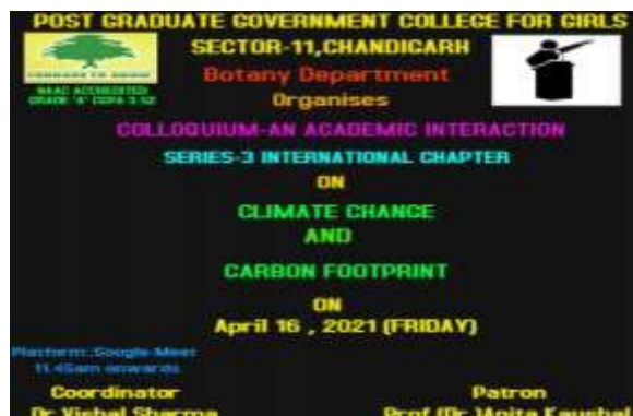
Brochure of the event