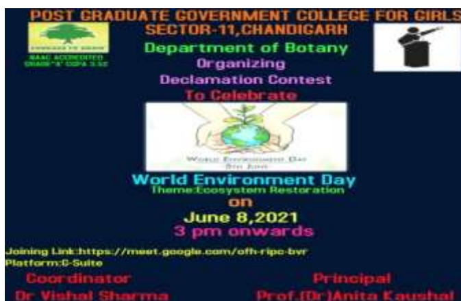
Brochure of the event

In order to create mass awareness, Botany Department organizing “Intra-College Declamation content from 5 th to 8 th June, 2021 on topics: Artificial Intelligence-A Game Changer for Climate Change, Human Computer Interface, Artificial/Synthetic trees, Role of recombinant Biotechnology in Human welfare, “We’re art of Solution”, Recent innovation in Basic Sciences, Global Warming, Ozone Layer Depletion. Students were apprised of the history of WED. In 1972, the UN General Assembly designated June 5 as World Environment Day (WED). The first celebration under the slogan “Only One Earth” took place in 1974. WED, a pinnacle of environment activities has developed as a platform to raise global awareness on the problems facing our environment (air pollution, plastic pollution sustainable consumption, global warming and food security) and need to take positive environmental actions. 100 students from PG and UG classes participated in the event.