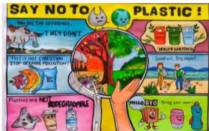
No Plastic Day-Poster Making