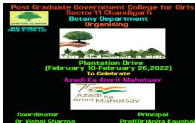
Brochure of the Event

Botany Department has organised plantation drive on 10 th February to 26 th February, 2022 to celebrate Azadi ka Amrit Mahotsav. More than 200 saplings of medicinal and ornamental trees of Azadirachta indica (Neem), Butea monosperma (Flame of the Forest; Palash), Cassia fistula (Amaltas), Mangifera indica (Mango), Mimusops elengi (Maulsari), Tamarindus indica (Imli), Putranjiva roxburghii (Putranjiva), Tinospora cordifolia (Giloy) were planted across the campus by teaching and non-teaching faculty.