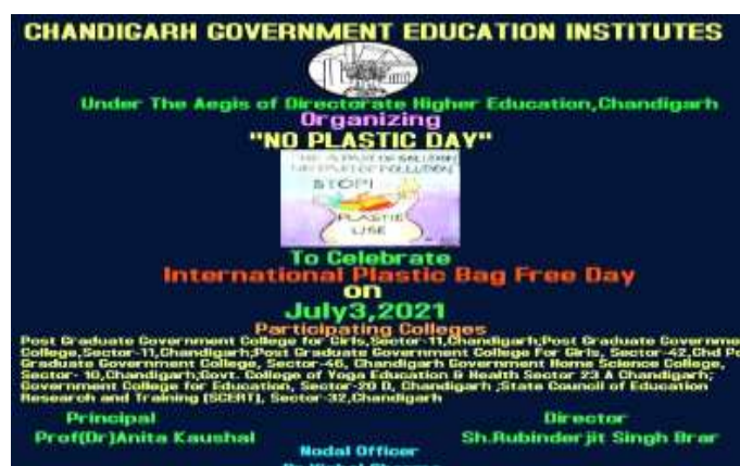
Brochure of the event

PGGCG-11, Chandigarh along with other Educational Institutes of the city (under the aegis of Directorate Higher Education) launched a campaign on “No Plastic Bags Every Saturday” on 3 rd July, 2021 , which is celebrated as International Plastic Bag free day, a global initiative that aims to eliminate the use of plastic bags. The campaign has promoted 3R-Reduce, Reuse and Recycle plastic bags to manage approx.17.6% plastic waste in the institutes. The objective of the campaign is to support the government effort to preserve the environment and improve knowledge awareness amongst households on eco-restoration and to plastic free campuses in the coming days. All colleges organised various activities like rallies, poster making and slogan writing competitions and interaction with stakeholders in the past to create mass awareness and around 50 thousands students, teaching and non-teaching faculty took pledge on the day to mitigate the negative effects of single use plastics and plastic items to achieve zero waste sustainable future.