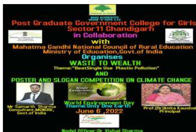
Brochure of the Event