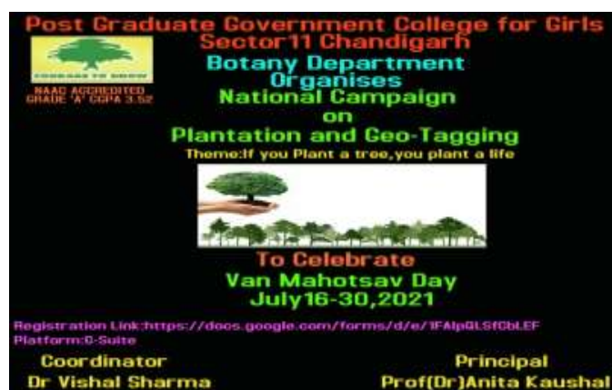
Brochure of the event

Department of Botany (Green Thumbs), Post Graduate Government College for Girls, Sector 11, Chandigarh, has taken initiative to organize “National Campaign on Plantation and Geo-tagging” 16 th July to 30 th July, 2021 with a theme “If you plant a tree, you plant a life”. Van Mahotsav is an annual tree plantation movement in India celebrated in the month of July to create awareness about the bad effects of deforestation. The vision of campaign is to encourage community outreach and to raise public awareness on environmental pollution and eco-restoration. The pioneer National campaign witnessed massive public support and cooperation nationwide, around 400 people from Chandigarh, Delhi, Haryana, Himachal and Punjab participated, belonging to different strata of society and planted multipurpose trees of medicinal value i.e Azadirachta (Neem), Cedrus, Citrus, GulMohar, Hibiscus, Ixora, Mangifera, Mimusops, Moringa, Morus, Phyllanthus and Tecoma.