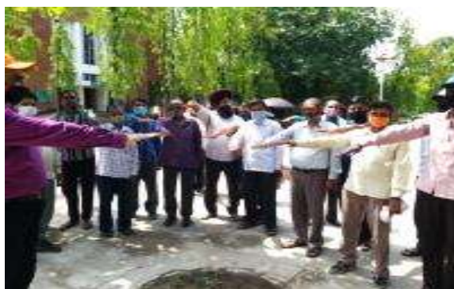
Rally on International Plastic Bag Free Day