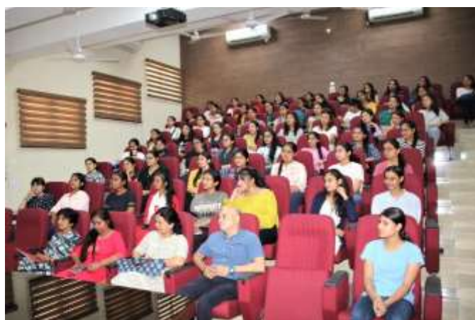
Waste to Wealth Workshop