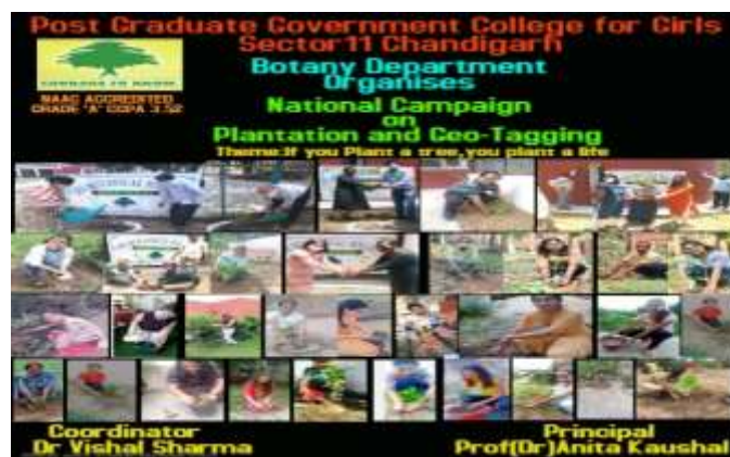
National Campaign on Plantation and Geo-Tagging