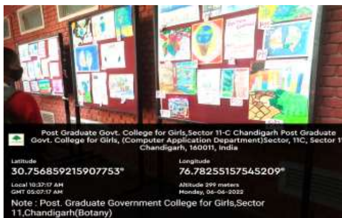
Display of Posters after Competition

Post Graduate Government College for Girls, Sector-11, Chandigarh in collaboration with Mahatma Gandhi National Council of Rural Education (MGNCRE), Ministry of Education, Government of India organized Poster and Slogan competition on topic “To mitigate carbon footprints with the lowering of energy consumption, solid waste management and water conservation” 5 th June, 2022 . This event was organized to aware the students about the elevated population and energy consumption resulting in high rates of greenhouse gases (GHGs) emission which results in climatic change and the paradigm of ‘waste to energy, mitigation of carbon and its sequestration is relegated to a secondary level which conversely results in India discarding 68.8 million tonnes in landfills and comes third after China and US in total GHGs emission. and results in acute problem of carbon footprints and conforming to Paris Agreement, COP21 and to limit temperature rise to 1.5 0 C to moderate the micro-climate of the campus. More than 200 students participated in the event.