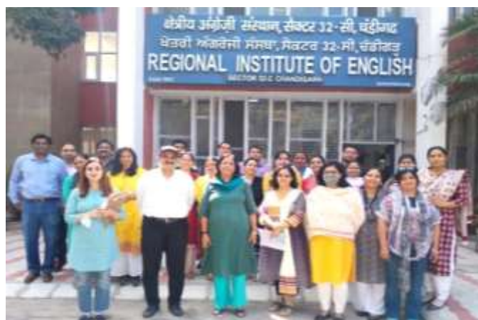
Water Day Celebrations