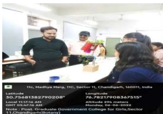
Resource Person interacting with Participants