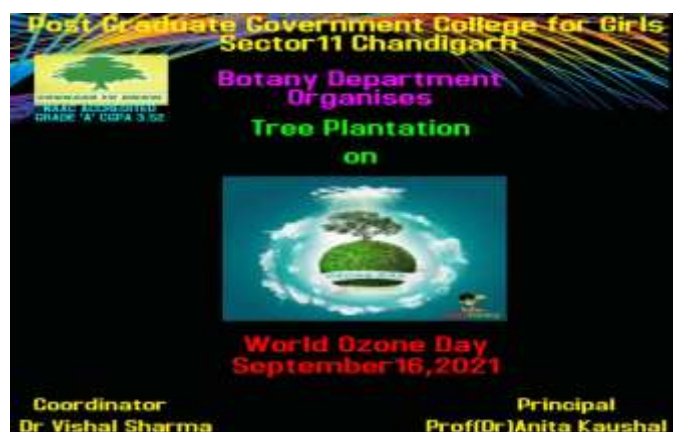
Brochure of the event

Botany Department (Green Thumbs) of Post Graduate Government College for Girls, Sector 11, Chandigarh, on the occasion of International Ozone Day 16 th September, 2021 , planted more than 100 multipurpose trees of medicinal and ornamental value i.e Ashoka ( Saraca indica ), Azadirachta indica (Neem), GulMohar ( Delonix regia ), Mango ( Mangifera indica ), Harshingar ( Nyctanthes arbortristis ), Palash ( Butea monosperma ), Tecoma ( Tecoma stans ) by faculty and students. This plantation drive was carried out to emphasize the importance of the ozone layer which prevents high frequency ultraviolet rays of the sun from reaching the earth, thus protecting human beings from skin cancer and host of other diseases and growing trees to bring down carbon dioxide emissions and thereby hampering depletion of the ozone layer. The solution of environmental problems like Global warming, Ozone depletion and pollution lies in planting more trees as forests are the only natural industry which is prime source of environmental purification and beautification.