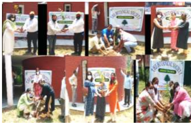
Faculty Members planting Saplings during Tree Plantation Drive

Botany Department has organised plantation drive on 6 th June, 2022 to celebrate Environment Day and Azadi ka Amrit Mahotsav and mitigate carbon footprints through carbon offshoots. More than 100 saplings of medicinal and ornamental trees of Azadirachta indica (Neem), Butea monosperma (Flame of the Forest; Palash), Cassia fistula (Amaltas), Mangifera indica (Mango), Mimusops elengi (Maulsari), Tamarindus indica (Imli), Putranjiva roxburghii (Putranjiva), Tinospora cordifolia (Giloy) were planted across the campus by teaching faculty.