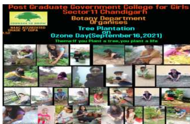
Tree Plantation drive on Ozone Day