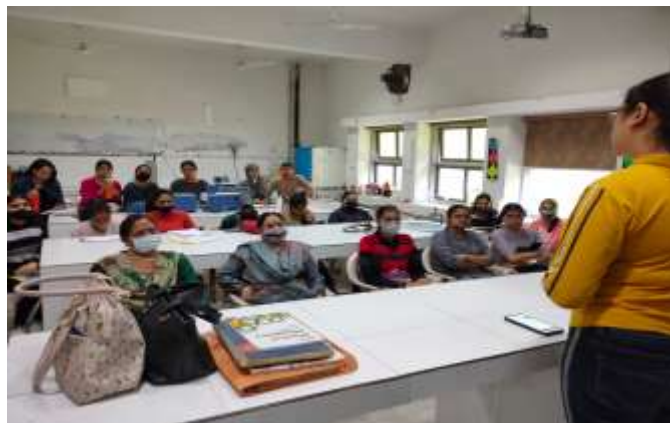
View of Audience

The objective of this day 09 th March 2022 is to create a better gender-neutral society by generating discourse. Later the students of B.Sc. II & M.Sc II started their open house discussion. They discussed in detail about women empowerment, women in stem, breaking the bias and women in science . Around 50 students participated in the above event.