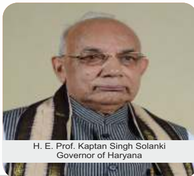
H. E. Prof. Kaptan Singh Solanki Governor of Haryana