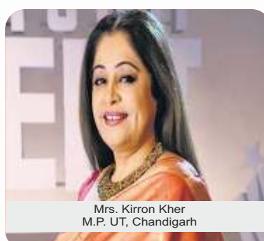
Mrs. Kirron Kher M.P. UT, Chandigarh