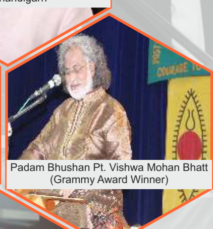
Padam Bhushan Pt. Vishwa Mohan Bhatt (Grammy Award Winner)