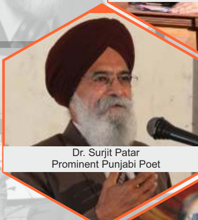
Dr. Surjit Patar Prominent Punjabi Poet