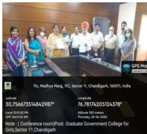
MOU being signed between RCED & PGGCG-11, Chandigarh