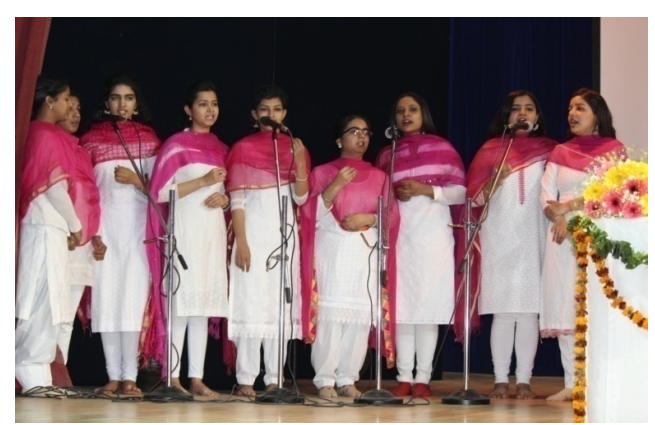
Students Performing during Cultural Evening

The cultural society of PGGCG-11 presented cultural items in the College auditorium on 23<sup>rd</sup> February, 2018 as part of the cultural evening organised in the International workshop.250 delegates and students witnessed the show.