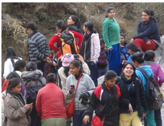
Visit to Bharatpur Wetlands

The department organized a field survey for Disaster Management students to Bharatpur Wetlands on 31 st January, 2018 . Total no. of 100 students visited the wetland which are also a Ramsar site. The students gathered information on emotional pattern and drainage system. A complete report after compilation of data was submitted to the department by each student.