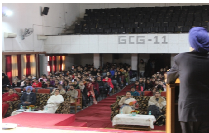
Audience (staff and students)