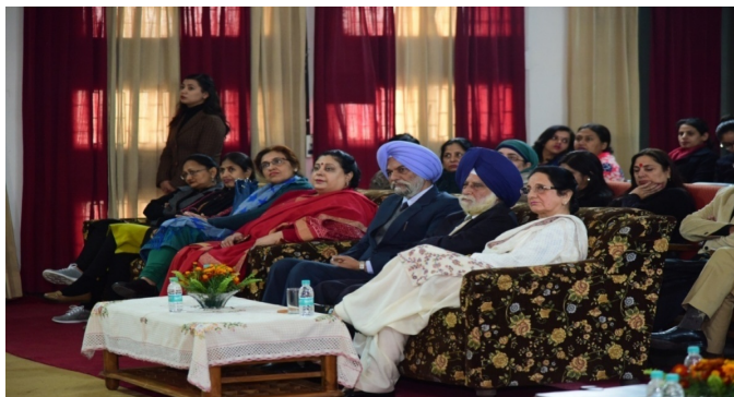
Principal and resource persons

Department of Economics, Post Graduate Government College for Girls Sector-11, Chandigarh, organized one day capacity building workshop on 24 th January, 2018 , under the aegis of RUSA. in the college on the topic “Sustainable and Harmonious Development in India: Issues and Challenges”, Invitation letters were sent to all the PU affiliated colleges of the city. Resource persons were selected and invited on the basis of their expertise knowledge and experience in the field. About 100 faculty members, research scholars and 400 students from the college and other colleges participated. The workshop comprised of three sessions including inaugural session.