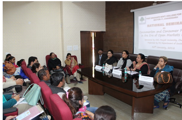
National Seminar on Consumerism and Consumer Protection in the Era of Open Markets in India