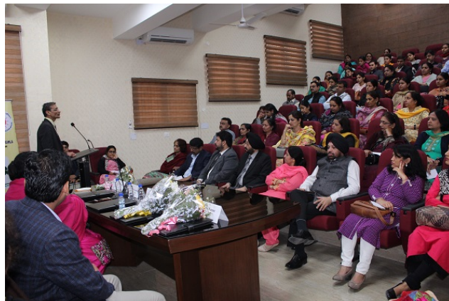
Workshop on Research Ethics, Plagiarism and Quality Research Papers