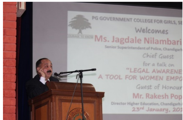
Talk on Legal Awareness: A Tool for Women Empowerment