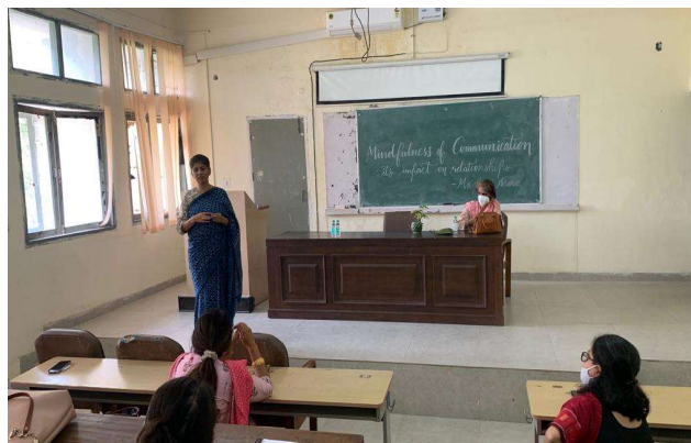
Talk on Mindfulness of Communication: It's Impact on Relationships