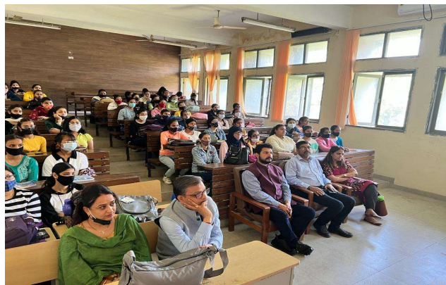
Staff and Students Attending the Lecture