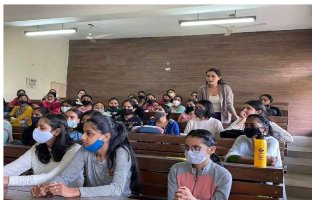
Students Participating in Discussion