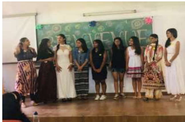
Students sharing their views