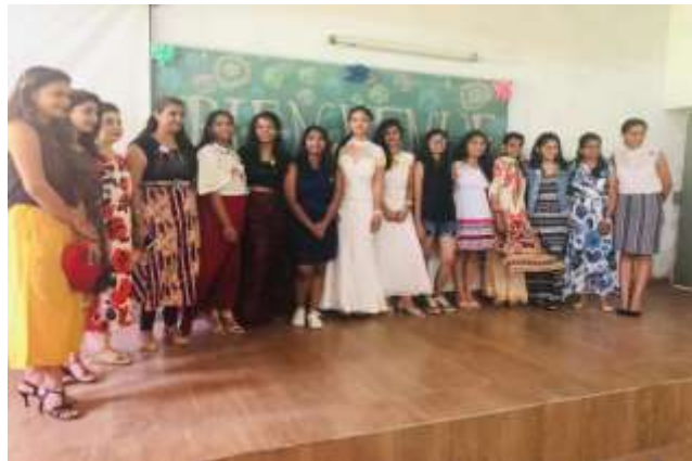
Students participating in the event

The Department of French, PGGCG-11, Chandigarh, organised an interactive session for the students of B.A-I, II & III on 14 th September, 2018 . 72 students attended the session. It was a very fruitful session as the students shared their experiences in learning of a foreign language. The students of senior classes i.e. B.A-III and also those of B.A-II organised various activities which included tongue twisters, question and answer rounds etc. A cultural program including dance and music performances from students was held.