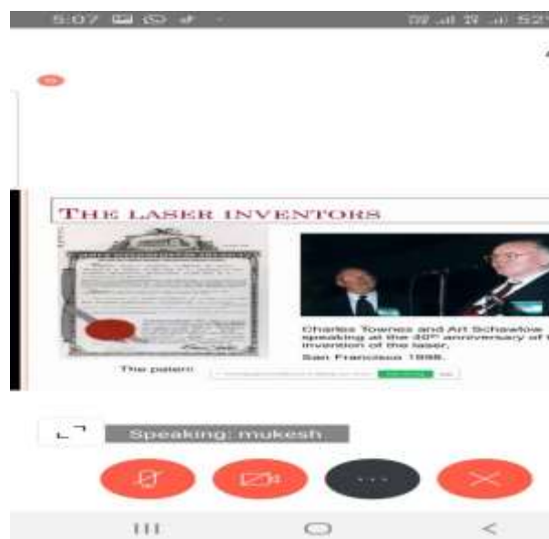
Presentation shared by the Speaker