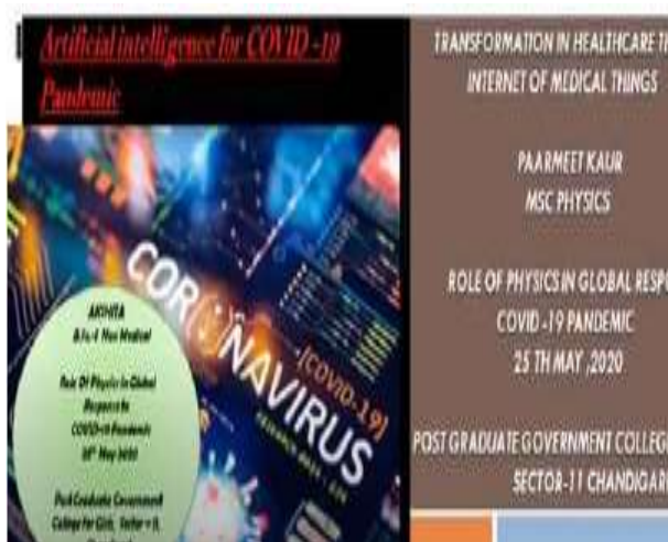
Screenshot of student presentation

In the webinar organized by the Department of Physics on 25 th May, 2020, Undergraduate and M.Sc. Physics students gave presentations on various topics such as Robot detector, Artificial Intelligence, Internet of Medical things and Cyber world and data security. This kind of activity makes students well versed with the current situation and how to deal with it positively. Approximately 100 students attended the event.