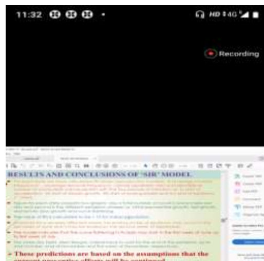
Online Presentation by speaker