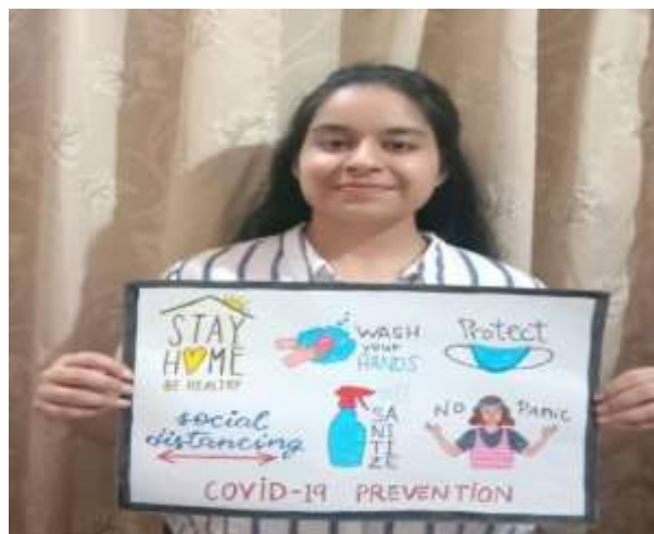
Poster Making activity by student