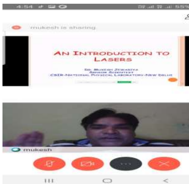
Speaker Presenting Online