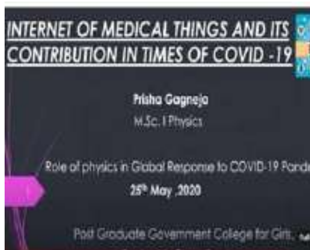
Screenshot of student presentations