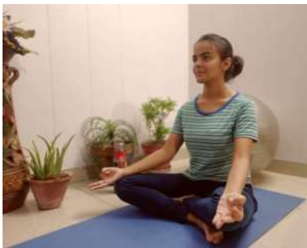
Student performing Yoga activity