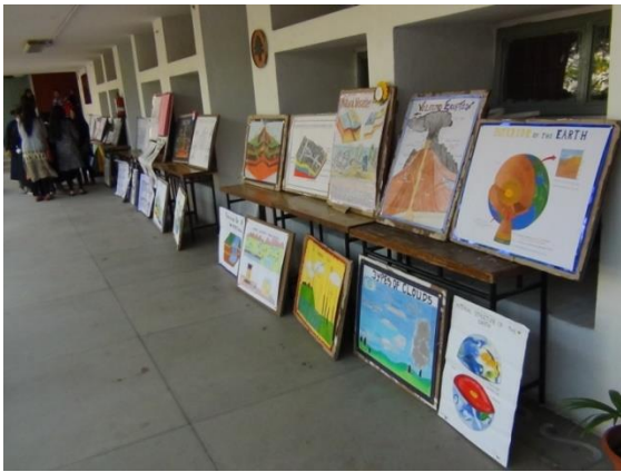
Display of Charts and diagrams

The programme was concluded with a cultured programme following by prize distribution.