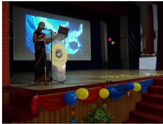
PPT presentation during Globus Function