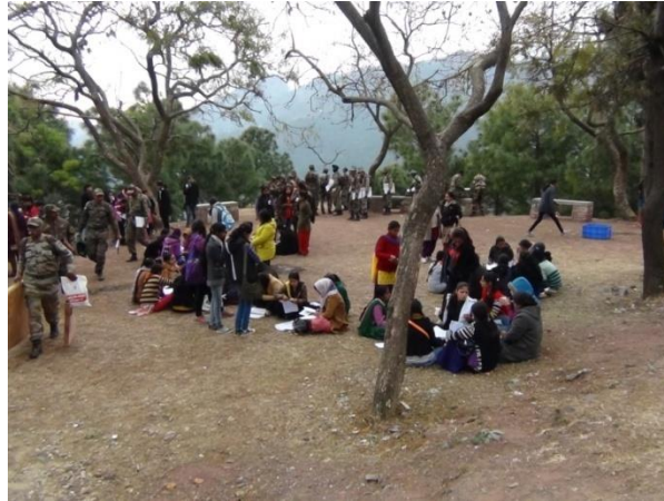
Data compilation during the field survey

The department organized a field survey for B.A.III students to Shri Anandpur Sahib on 24 th January, 2019 . The topic of the survey is “Impact of Tourism on Heritage site of Shree Anandpur Sahib”. Students visited the area and collected data with the help of questionnaires. A detailed report is prepared for the entire survey. A total of 82 students were a part of the survey.