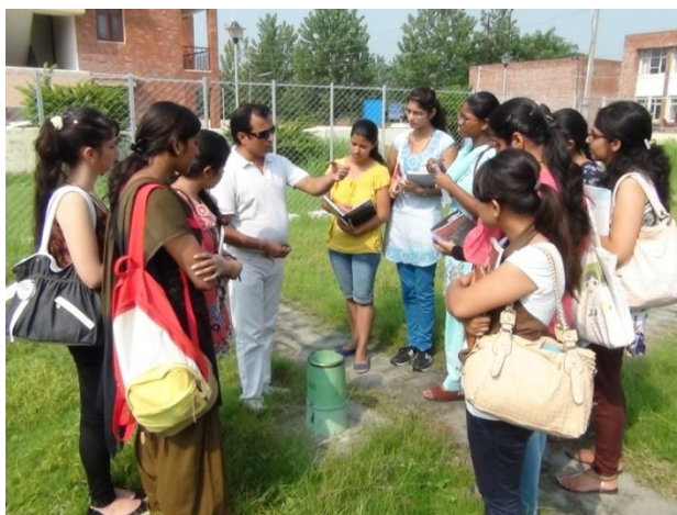
Briefing on how to collect the weather data

Visit to Meteorological Department to celebrate 'World Meteorological Day. On 26 th September, 2018 . Total no. of 92 students visited the department. The students were given information on methods of data collection, use of GPS in weather forecasting and practical demonstration of weather instruments. The students and staff gathered knowledge on collection of weather data and their practical usages.