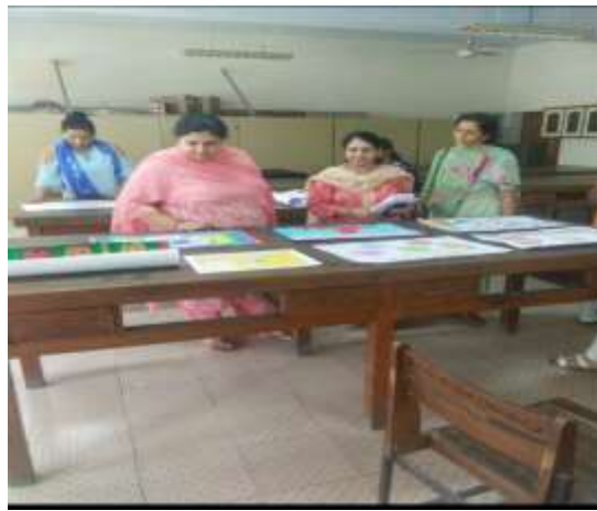
Principal and staff members judging the posters

Department of Home Science observed Nutrition Week on 5 th September, 2017 . The Nutrition Week Celebration included various events like Cookery Contest; preparation of Nutritious recipes and Poster Making Competition was held on the theme “Nutritious Breakfast for Overall Well Being”. A Lifestyle and Wellness clinic was also inaugurated by the principal. Around 50 students took part in the competitions with great enthusiasm. The winners were given prizes by the principal and their efforts were appreciated by the principal.