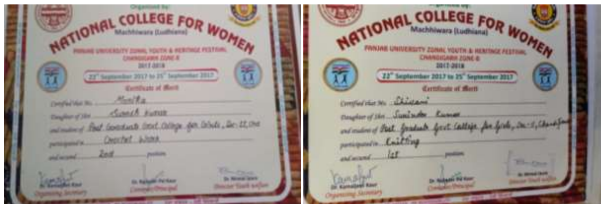
Certificates of prize winning participants