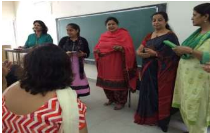
Prize distribution to the winners