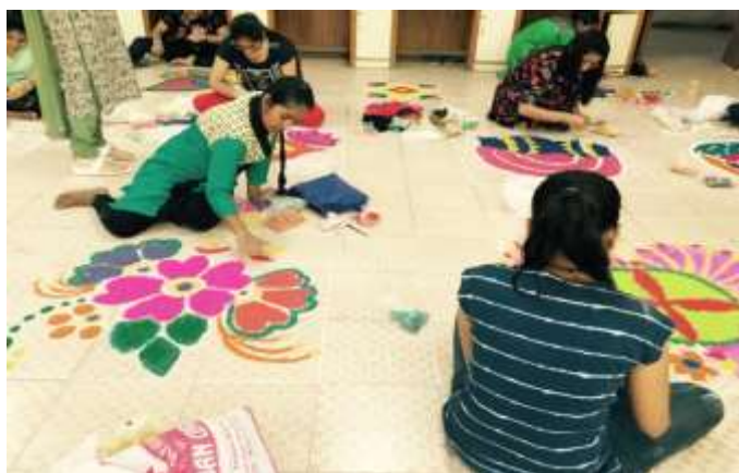
Participants making Rangoli for the competition

Home Science Department organized a talent hunt contest on 24 th August, 2018 . The contest was in various events like Rangoli, Mehendi, Knitting, Crochet, Phulkari, Bagh, Phakhi weaving, Dasuti, Guddian Patole making, Eenu making, Rassa vatna, Chhikku making, Naala making, Paranda making and Peedi making. Around 55 participants showcased their skills in these events. The competition among the students was tough and the winners of the competition were given 1 st , 2 nd , 3 rd and consolation prizes by the principal. Principal addressed the students and motivated them to develop their skills further.