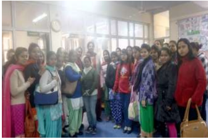
Staff member of Nursery school interacting with students

An observational visit to Chaitanya Nursery Lab in Govt. Home Science College, Sector 10, Chandigarh was conducted on 13 th September, 2018 . The aim of the visit was to give exposure to students of different teaching methods and functioning of Lab Nursery School. Students observed the children and their activities which in turn helped them to make aware of the opportunities available in preschool education. There were 45 students in total who went for the visit. Staff members accompanied the students for the visit.