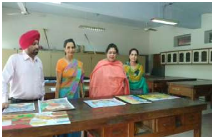
Principal and staff members judging the posters