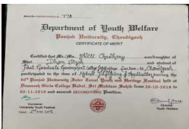
Certificates of prize winning participants