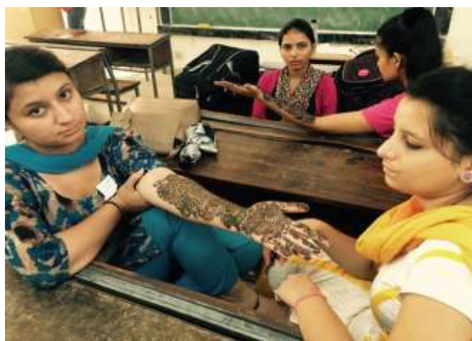
Students participated in the Mehendi competition