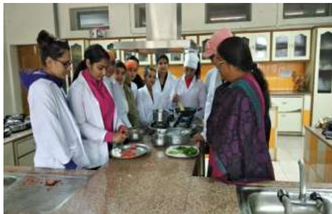
Staff member along with the Participants