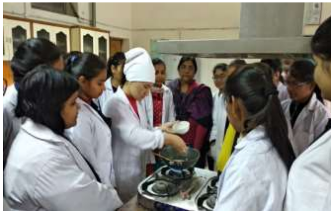
Students taking part in the Demonstration

A two day workshop on preparation of Nutritious Tibetan dishes was held on 7 th and 8 th February, 2019 in the department. The aim of this workshop was to enable the students to gain new food preparation skills. The dishes prepared were “Tukpa” and “Momos”. The students were given an insight about the personal hygiene, clothing to be worn and safety precautions in the kitchen. During the workshop various techniques and tips involved in cooking were also discussed. 45 students of BA final year participated in this workshop.