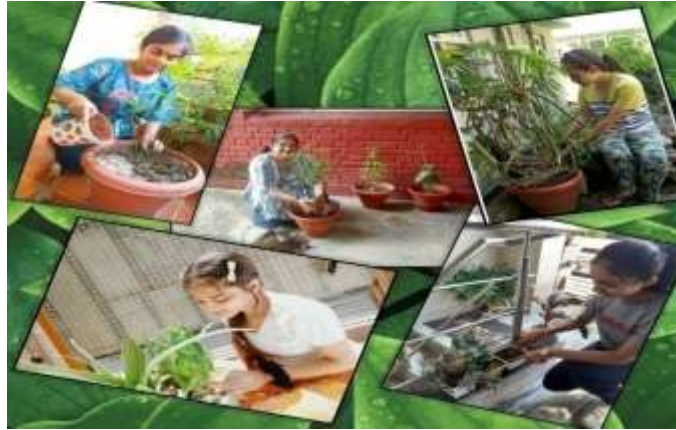
Volunteers and students participated in the plantation drive

On the occasion of the National nutrition month (Rashtriya Poshan Maah) Tree plantation drive was carried out during whole the month of September, 2021 . NSS volunteers and home science students took an active part in this drive.