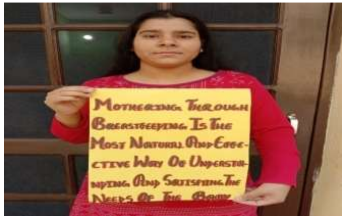
Participants presented slogan for the competition

On the occasion of National breast-feeding week, slogan writing competition was organized from August 1 st to 10 th , 2021 . The theme of the competition was “Protect Breast Feeding: A Shared Responsibility”. The aim of this activity was to motivate the students for circulating the message of importance of breast feeding to the community at large. 35 students of Home science participated in this competition enthusiastically.