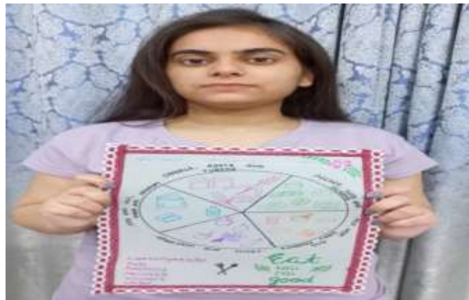
Participants presented their posters for the competition