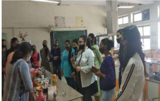
Students attending the demonstration