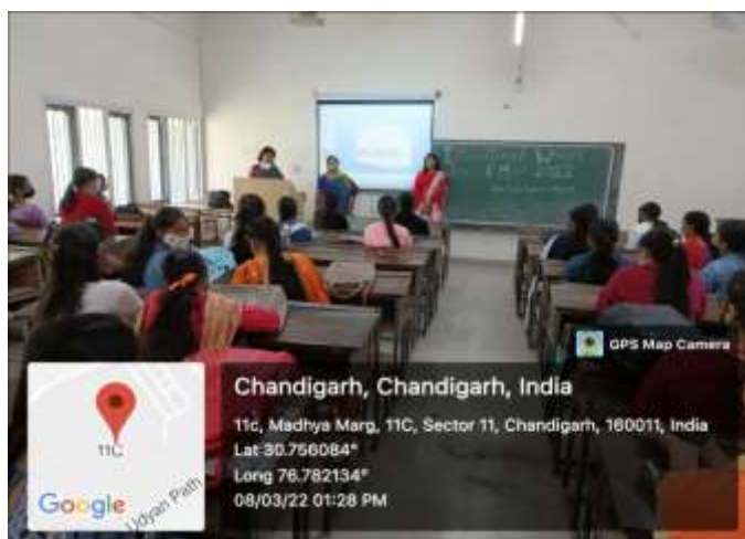
Staff members and students taking part in the interactive session