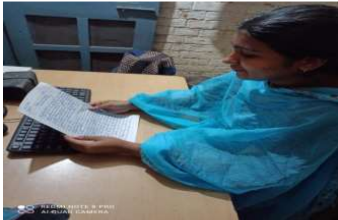
A glimpse of one of the participants sharing her views during the competition

On the occasion of the National nutrition month (Rashtriya Poshan Maah) online Paper Reading Contest was organized from 10-15 th Sep, 2021 . Theme of the competition was “Health at every size and mindful eating”. Home science final year students participated in this competition and shared tips for mindful eating.