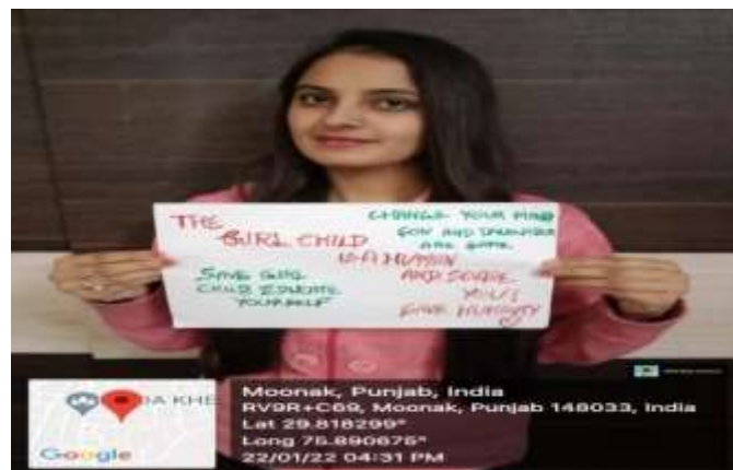
Participants presented slogan for the competition