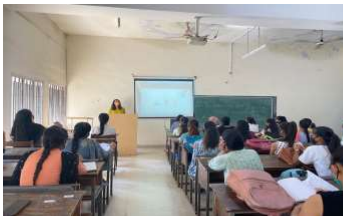
Resource person and participants taking part in the session