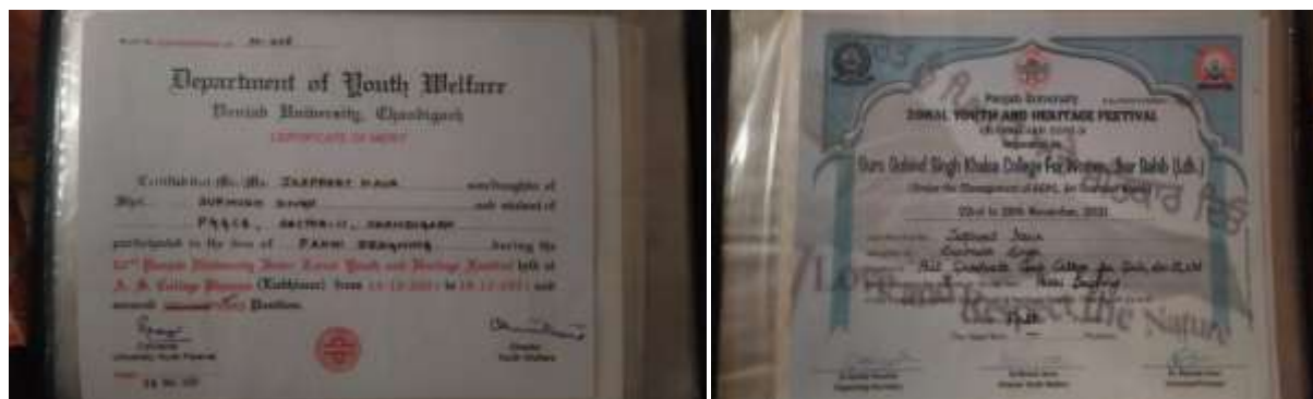
Certificates of the prize winning participants