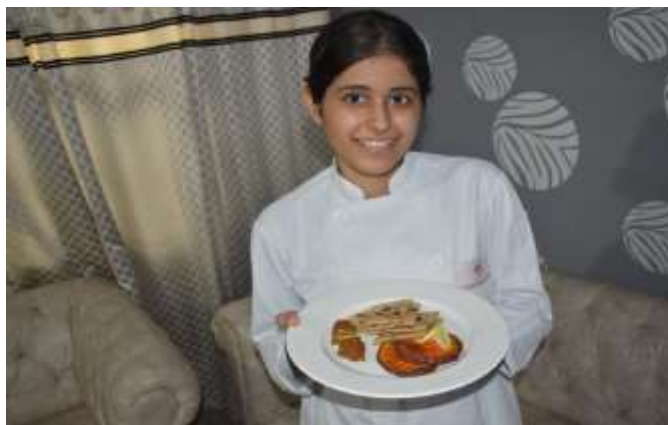
Participants presented their dishes for the competition