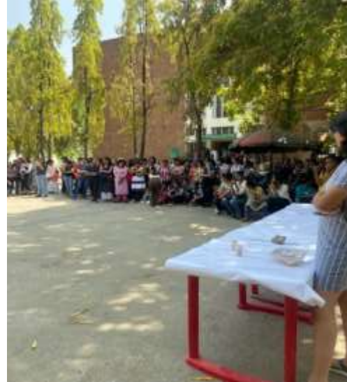
Students participating in Girl Up Zahanat Open Mic Event