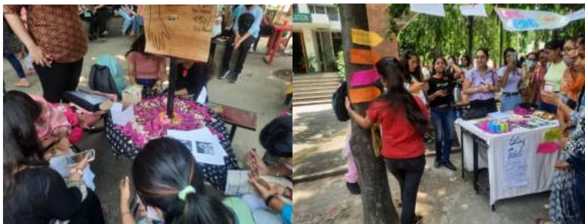
Joy of Giving – Annual Charity Fest

The annual charity fund raiser for the underprivileged Joy of Giving was organized on the campus on 13 th May, 2022 . Students put up stalls of games, food and drinks. The proceeds of the fest are utilized to help students from economically weaker sections of society. More than 150 students were part of the charity event.