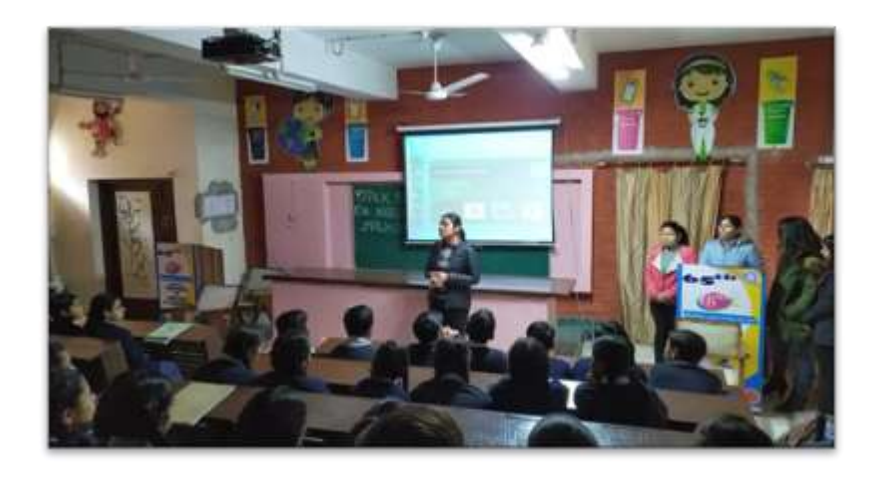
Career talk by students

The college students of Add-On Certificate course in Guidance and Counselling participated in a Career Talk presentation for 30 secondary level school students at the Government Model Senior Secondary School, Sector8-B, Chandigarh. The talk was held on 28 <sup>th</sup> January , 2020 at 10 a.m. at the lecture hall provided by the school's administration. The hall was equipped with necessary provisions for the students to deliver their presentations via Power Point.