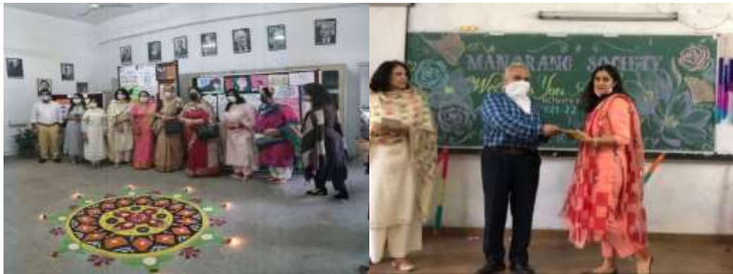
Abhivyakti- Annual Event of the department of Psychology

The Manorang Society organized its annual event Abhivyakti on 9 th October 2021 in which 300 students of Department of Psychology participated in various events like “Poster Making”, “Charismatic Personality”, “Folk song Competition” and “Debate” etc. Undergraduate and post graduate students of Psychology department actively participated in this event. The event was a huge success and prizes were given to the winners in respective competitions.