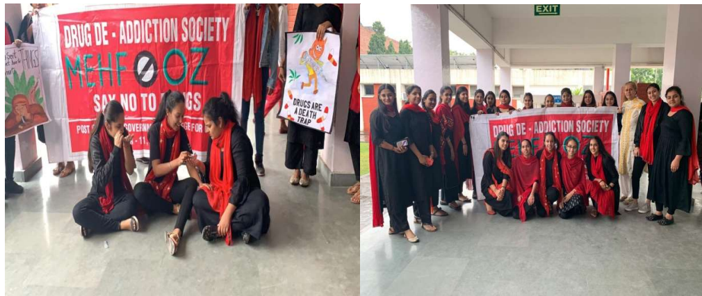
Skit performed in College with the slogan ‘Say No to Drugs’

Students of the Mehfooz society prepared and performed a skit on 7 th November, 2019 which began by saying aloud the slogan ‘Say No to Drugs’. In the skit, 30 students exhibited the issue of drug addiction via part of the life of a fictional character, Manvir. Manvir is a simple, decent boy who has topped the 12th board exams and his father, who is quite poor does everything in his capacity to arrange money and send his son to the city for higher studies. But as it turns out, Manvir falls into the trap of a bad company and start with drugs. As time passes, he becomes an addict and starts pressurizing his family for more money with the excuse of studies. One day, his friend from the village visits him and is left in a state of shock after seeing the condition of his dear friend. He takes his friend back to the village where he talks to his family, explains the situation to them and together they, with the help of a counsellor and rehabilitation centre are successful in bringing Manvir back to normalcy, free from drug addiction. The skit left a very good impact on the viewers with its message being ‘getting free from drug addiction is undoubtedly difficult, but it is not impossible’.