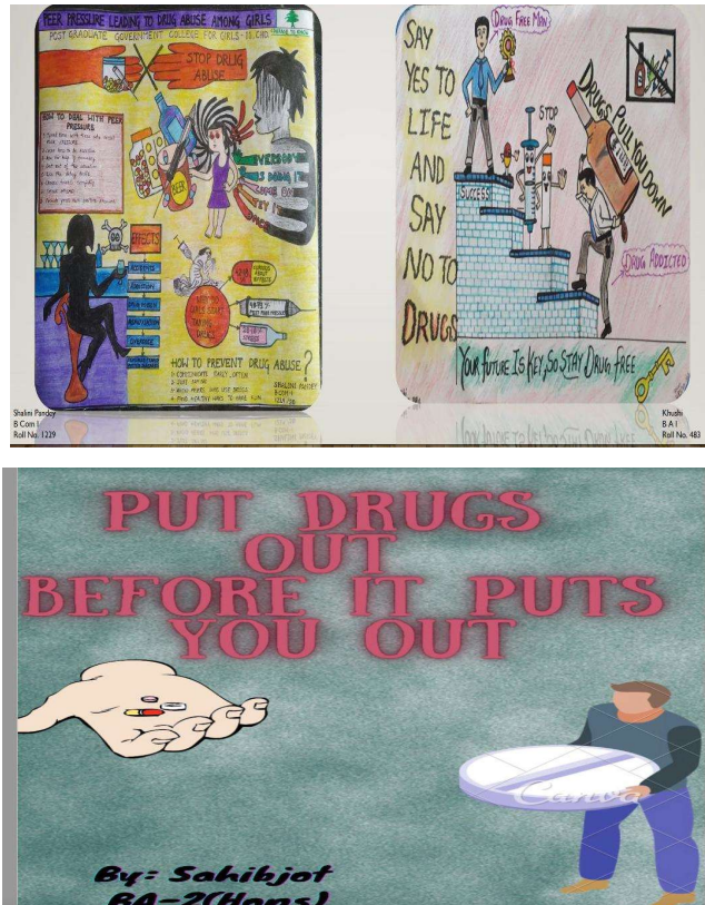
Posters made by students

An online Poster making competition was held with an initiative of Govt. of India's "NASHA MUKT BHARAT ABHIYAN" on the theme "Creating Drug Addiction Awareness Through Art" on 6 th February, 2021. Students presented their posters along with a detailed description of what they mean to depict in their artwork. This took place on google meet platform and 50 students participated in it.