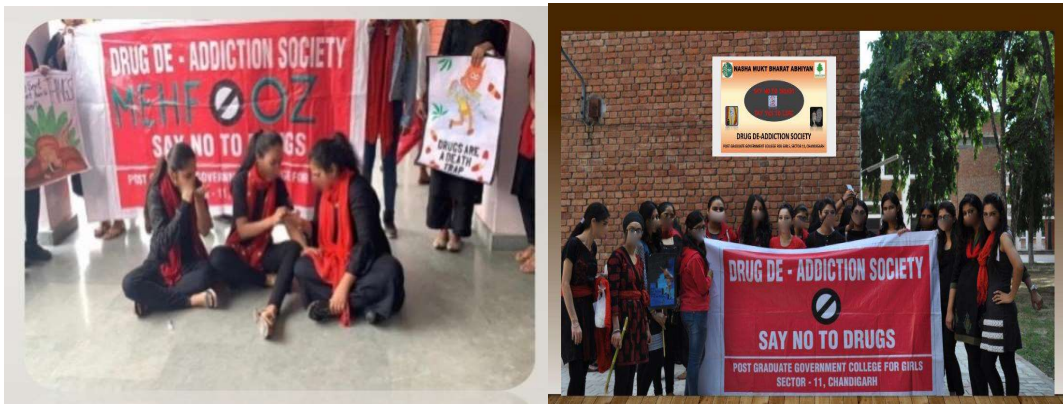
Students performing Nukkad Natak

A 'Nukkad Natak' was performed on 25 th & 26 th March, 2021 with the message of spreading awareness on drug addiction. It was performed by the student members of the society to highlight the issue of drug addiction through the life of a fictional character, Jeevan. Students performed this skit at college campus, college adopted village Khudda Jassu and at the Sector-17 plaza. They ended the natak by shouting the slogan 'Say No to Drugs', and the onlookers chorused with them and appreciated their effort. The skit left a very good impact on the viewers with its message being 'getting free from drug addiction is undoubtedly difficult, but it is not impossible'. Twenty students participated in it.