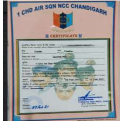
Attachments of the camp