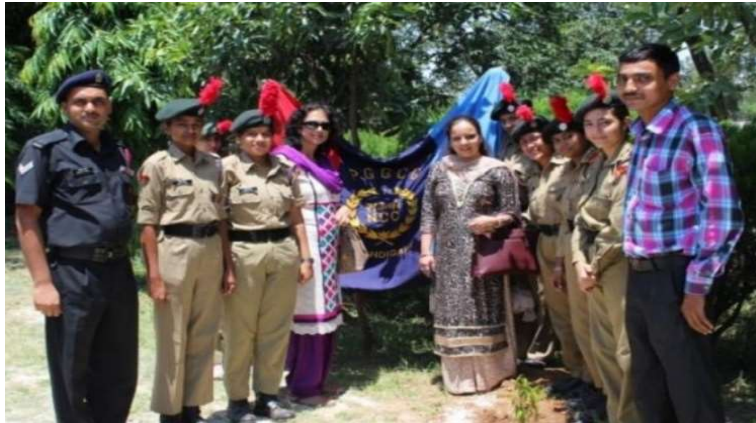
Cadets of PGGCG-11 for the Tree Plantation Drive

In view to support Government's initiative to plant more trees, Tree Plantation Drive was organized on 26 th July, 2017 at PGGCG – 11 in collaboration with NCC Unit. The students actively participated in the event and more than 40 saplings which were provided by the NCC Unit 01 Chandigarh Girls Bn Chd were planted in the college campus. The cadets participated in the drive enthusiastically and helped each other in planting the saplings. The cadets along with the also took an oath to look after the planted saplings, plant more and more trees and encourage others to do the same. Some of the students also shared their experiences and shared their joy with others. Such little steps taken together by will surely help in fostering strong mental and social health amongst today's youth.