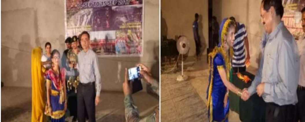
Cadets in Traditional Attire for Cultural Events during ATC

Annual Training Camps/ Combined Annual Training Camps (ATC/CATC) are held within the State under the aegis of respective NCC Directorates. Annual Training Camp (ATC) was attended by 31 Cadets at Government Home Science College, Sector – 10 Chandigarh from 30 th September, 2017 to 9 th October, 2017 . Various games and cultural events were organized in which our girls won 2 nd Prize in Football.