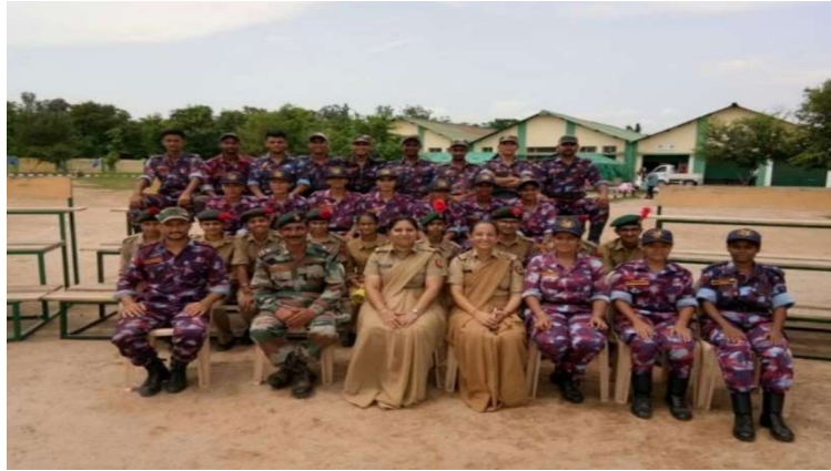
Glimpse of cadets from Pre TSC at NCC Academy Ropar

The aim of Thal Sainik Camp is to give an exposure to the salient feature of Army Training, generating healthy competitive spirit and fostering a sense of discipline, leadership and national integration amongst the cadets. Thal Sainik Camp is unique in its own way by being a National level camp for Army Wing cadets. 5 Cadets took part in Pre Thal Sainik Camp (TSC) from 15 th August, 2017 to 24 th August, 2017 held at NCC Academy Ropar.