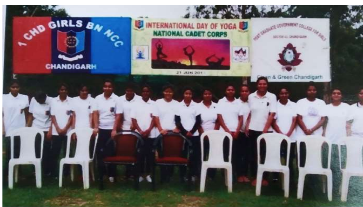
Cadets celebrating International Day of Yoga

Recognizing its universal appeal, on 11 th December 2014, the United Nations proclaimed 21 st June as the International Day of Yoga by resolution 69/131. The International Day of Yoga aims to raise awareness worldwide of the many benefits of practicing yoga. Annual Yoga day was celebrated on 21 st June, 2018 at PGGCG-42. 20 cadets from our institution participated with great enthusiasm.