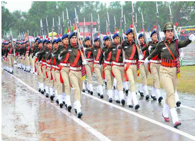
NCC Cadets at Republic Day Parade Chandigarh

The Delhi Republic Day parade is the largest and most important of the parades marking the Republic Day celebrations in India. The parade takes place every year on 26 th January at Rajpath, New Delhi. It is the main attraction of India's Republic Day celebrations, which last for three days. The first parade was held in 1950, and it has been held every year since. Cadets also took part in Republic Day Parade on 26 th January, 2018 at Parade Ground, Sector – 17 Chandigarh and won 2 nd position in it.