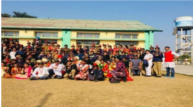
Cadets giving tribute to Mahatma Gandhi in his Death Anniversary

On January 30 th , 1948, Mahatma Gandhi was assassinated by Nathuram Godse in Birla House. 30 th January each year mark the death anniversary of the father of nation, Mahatma Gandhi. The day is also celebrated as Martyrs' Day to commemorate freedom fighters who sacrificed their lives to get us freedom. A Tribute Giving Event on Mahatma Gandhi's death anniversary was held at War Memorial, Sector – 3 Chandigarh on 30 th January, 2018 . Our 11 Cadets participated in this event.