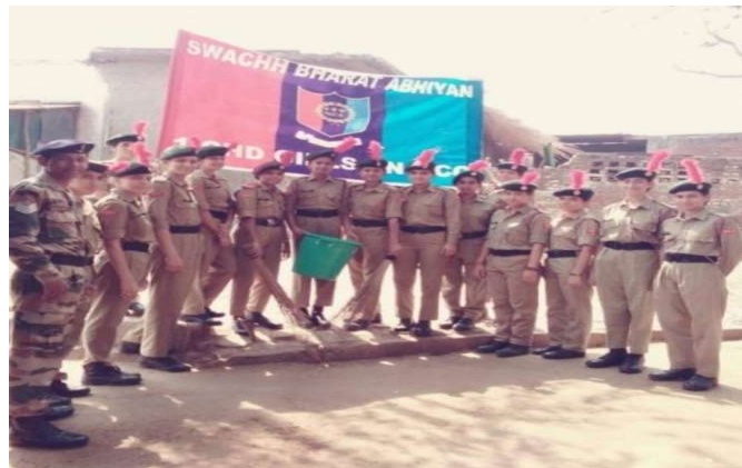
Cadets during Independence Day Parade Sector-17, Chandigarh

Independence Day is celebrated annually on 15 th August as a public holiday in India commemorating the nation's independence from the United Kingdom on 15 th August 1947. Every year on this day NCC cadets take part in NCC Parade held at sector-17 CHD. 8 Cadets of NCC Army Wing from our college took part in the Independence Day Parade on 15 th August, 2017 which was held at Sector – 17 Parade Ground, Chandigarh.