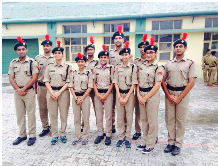
Cadets at DCAT Ropar

These camps are held within the state under the aegis of respective NCC Directorates. The duration of this camp is usually held for 7 to 10 days. 10 Cadets of NCC Army Wing from our college attended DCAT (Directorate Combined Annual Training Camp) held at Ropar from 12 th November, 2017 to 21 st November, 2017 which is a regional Training Camp comprising the Cadets from the states of Chandigarh, Punjab, Haryana and Himachal. The main focus of this camp was to develop personality development and get a glimpse of military camp. In camp cadets had different sessions like map reading, weapon training, drill practice, drill competitions, health and hygiene.