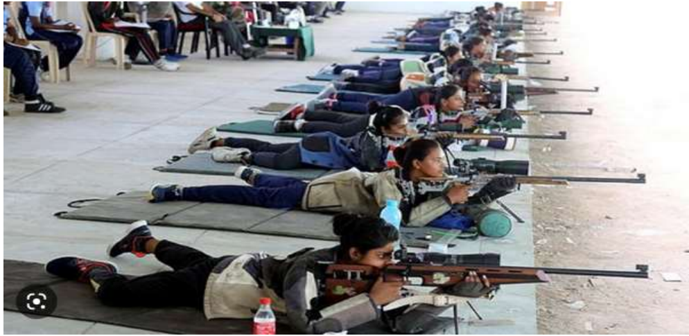
Cadets Practicing Shooting at Sector-25

Shooting sessions are carried out for NCC cadets in which the 0.22 Deluxe rifle is usually used. Here cadets learn different positions of firing, how to aim, trigger and know about various parts of a rifle. This year Shooting practice session was held at Shooting Range, Sector – 25 Chandigarh on 17 th January, 2018 . It was organized by NCC Unit. 34 Cadets were part of it and enhanced their shooting skills.