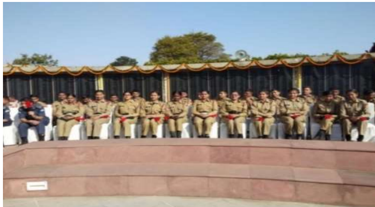
Cadets during the Camp