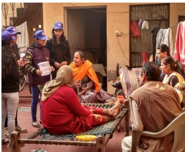
Interaction with villagers