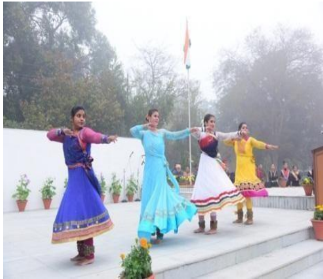
Independence Day celebration

On 15 th August, 2017 around 87 NSS volunteers of the college celebrated the Independence Day in the college. Principal of the College hoisted the flag. A cultural Programme was arranged by the students. Patriotic speeches were made by some of the NSS volunteers. The President of the NSS units administered a pledge to work for protecting the democratic traditions of the country.