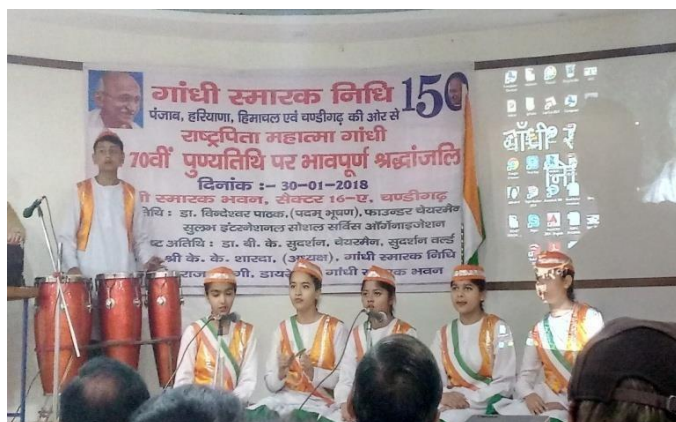
Celebration of the day