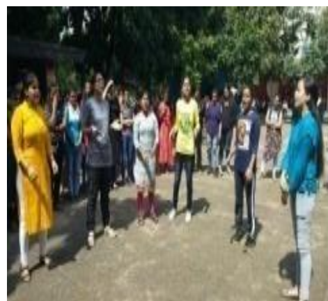
Awareness about Swachhta in college and at Khudda Jassu