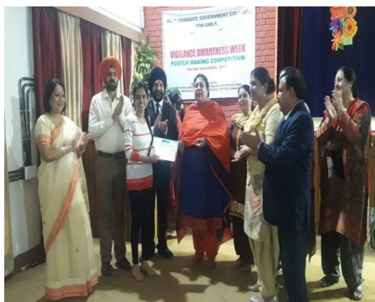
Poster making and Slogan writing competitions