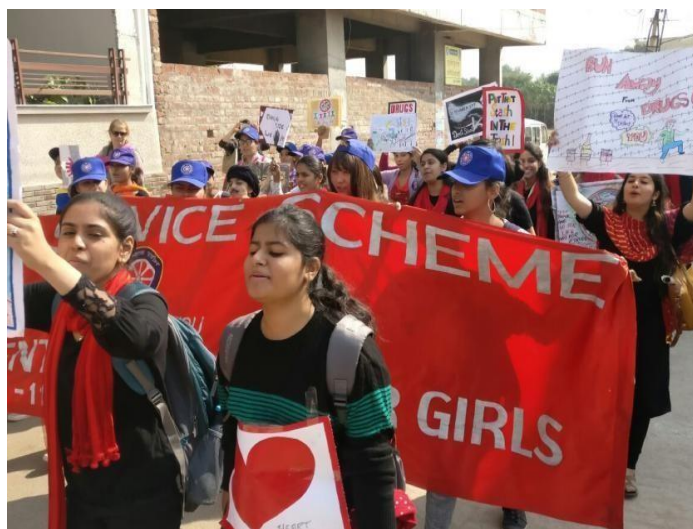
Drug De-Addiction Drive

Drug De-Addiction Drive was held on 2 nd February, 2018 , Volunteers charged with the anti-drugs slogans like "Say No To Drugs" Jan Mein Yahi Sandesh Nasha Mukht Ho Apna Desh. Rally was taken out in the adopted village Khudda Jassu to bring forth awareness among the masses. Posters were made and apt slogans were raised. Fifty students joined the drive.