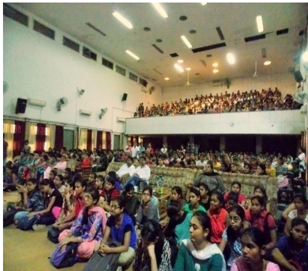
Celebrating NSS Day

On 24 th September, 2017 NSS day was celebrated in auditorium. NSS volunteers of eight units were gathered and they shared their experiences. Dr Manoj gave briefing and shown a PPT on the activities of NSS. Students participated enthusiastically and ended with NSS clap. One fifty students attended the function.