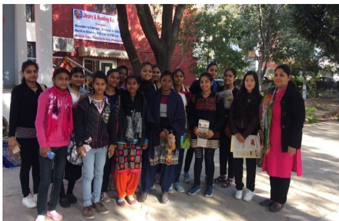
Visit to Gandhi Smarak