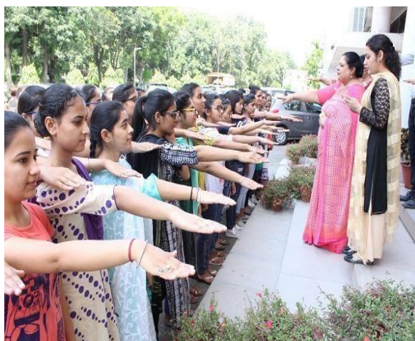
Volunteers taking pledge

The pledge for Swachhta was taken on 16 th September, 2017 followed by massive cleanliness drive of the campus. The NSS volunteers were divided into groups and allotted different areas of the campus under the supervision of the NSS Programme Officers. Twenty Five students attended.