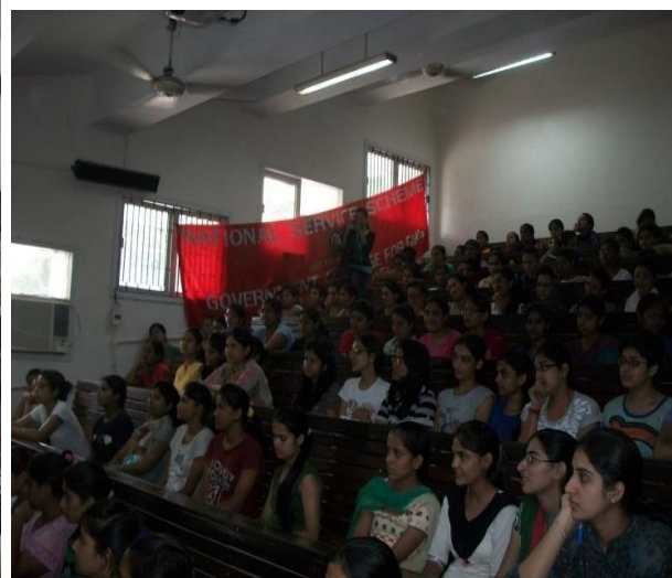
Volunteers taking Oath Assembled in a seminar room