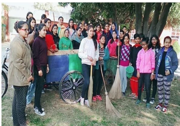
Cleanliness Drive in College Campus