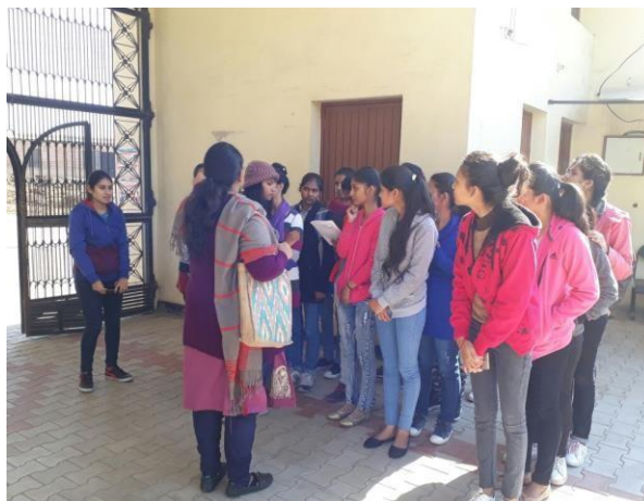
Interaction with the volunteers

On 4 th February, 2018 , awareness campaign was organized by the NSS unit of PGGCG-11 at their adopted village Khudda Jassu. NSS volunteers interacted with the resident of the village and made them aware about the benefits of healthy diet and its importance in daily life. Forty students joined the campaign.