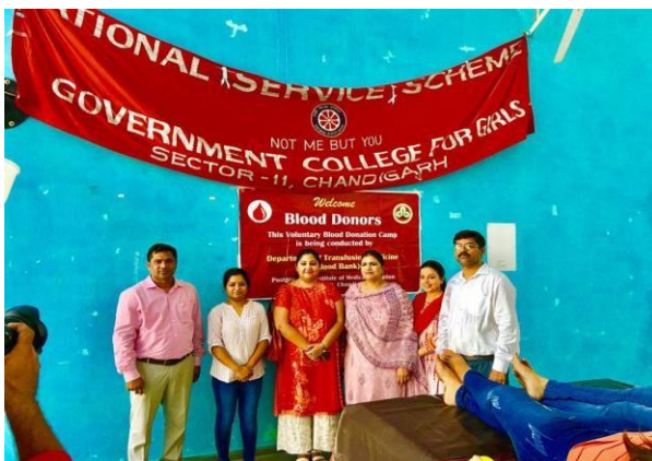
Enthusiastic Donors and Programme Officers