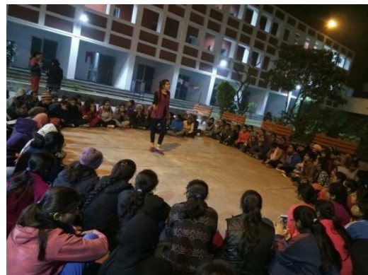
Volunteers during Camp