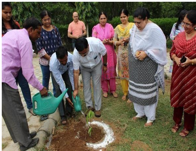
Tree plantation by the chief guest