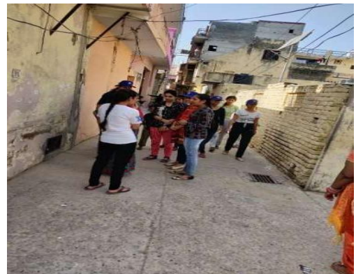
Visit to Khuddda Jassu