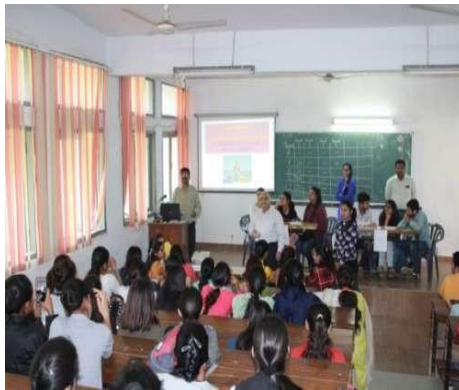
Participants during Inter College Quiz

NSS units of PG Govt. College for Girls, Sector 11, Chandigarh in collaboration with Prashasnika, society of Departments of Public Administration and Political Science organized an Inter-college Quiz on the theme Importance Of Unity Day And Contribution Of SardarVallabhBhaiPatelon 25 th October, 2018 . 66 students participated in the event. The objective of the quiz was not only to test the knowledge of today's generation on the theme but to also generate awareness about the significance of national unity and the role played by Sardar Vallabh Bhai Patel in independence struggle and National Integration. Teams from nine colleges and institutions of the city participated in the competition.