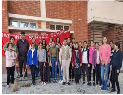
Cleanliness Drive in college campus