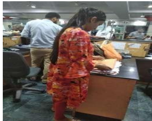
Students performing Activities