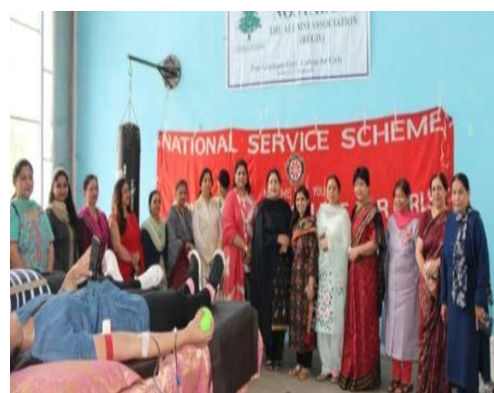
Blood Donation by volunteers