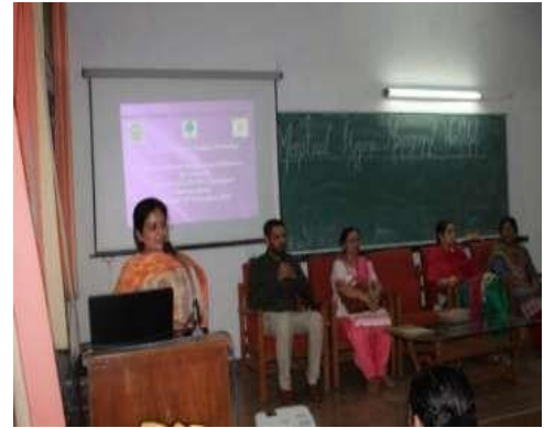
Speakers of the Day & Participants