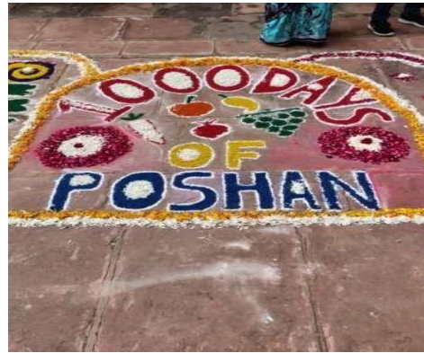
Inauguration of Poshan Mah by Administrator Honorable Governor