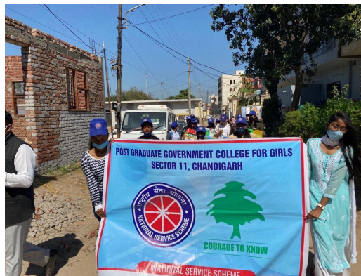
Swachhta Rally at Khudda Jassu