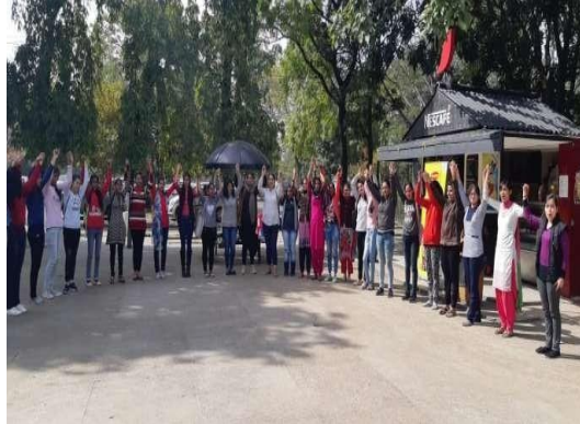
Human Chain on the Occasion of Women's Day

On 8 th March, 2019 , the occasion of women's day, 18 NSS volunteers of PGGCG-11, Chandigarh, performed a Skit in college campus and make a chain to show the women empowerment.