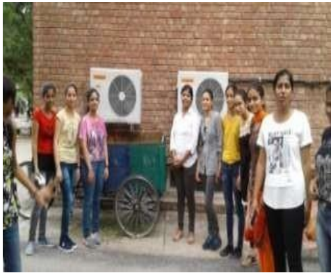
Students from different stream