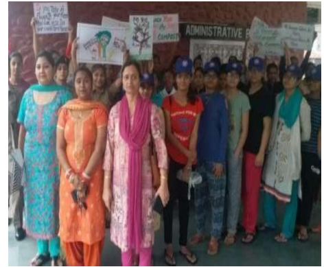
Volunteers with banner