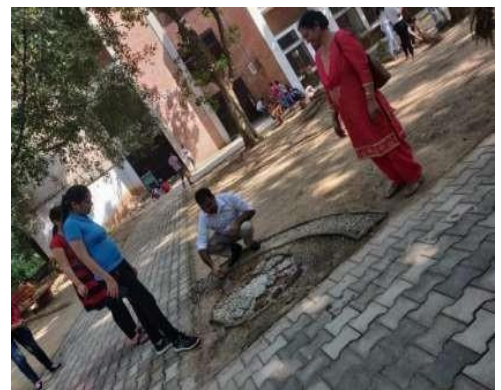
Awareness about water Conservation