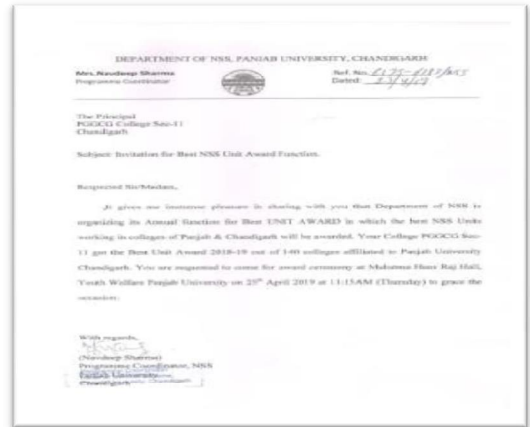
Letter of Best NSS Unit