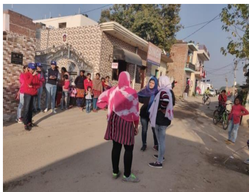
Nukkad Natak at Khudda Jassu Beti Bachao Beti Padhao

A NSS seven days (Day/Night) camp was organized from 22 nd December to 28 th December, 2018 . More than 150 volunteers participated in the camp. The theme of the camp was "Healthy and Skilled youth in a Swachh society". During the camp the volunteers visited the adopted village Khudda Jassu. Swachhta rallies, nukkad natak and door to door interaction were carried out to make the villagers aware about the importance of health and skill development in the village. Meanwhile, in the college experts delivered their lectures on Swachhta and students were sensitized.