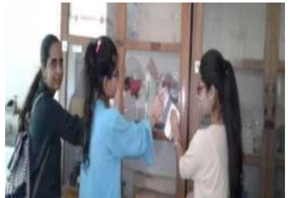
Students cleaning botany laboratory