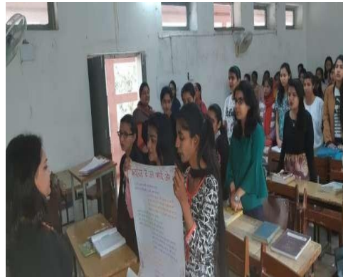
Poem Recitation and Life Sketch of Freedom Fighter's