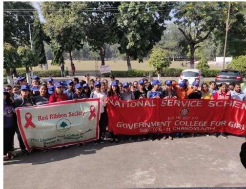
Awareness about AIDS day

On 1 st December, 2018, Aids Day a rally and candle light march was organized by NSS volunteers in association with Red Ribbon Club of the College in the Adopted village and Kudda Jassu. During the rally they made students aware of AIDS. 53 students joined the rally.