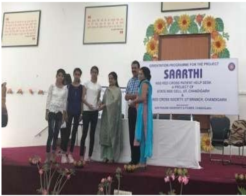
Students Participants in Project “Saarthi”