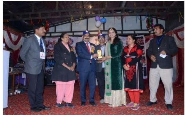
Student getting prize at NIC