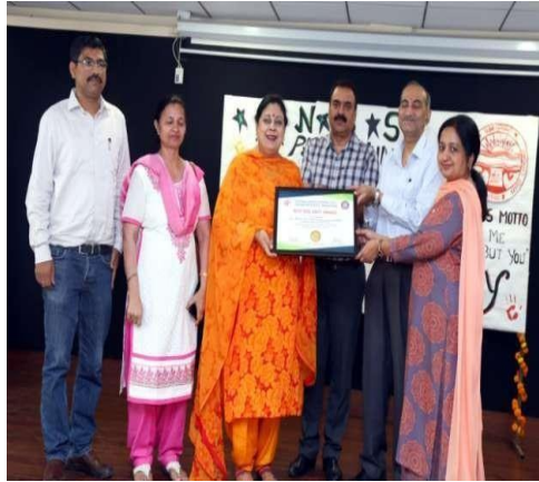
Best NSS unit Award

On 25 th April, 2019, PGGCG-11, Chandigarh that we got the best unit award in the annual function of department of NSS, Panjab University, Chandigarh.