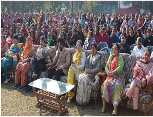
Staff on Republic Day

On the occasion of Republic Day, a function was organized on 26 th January, 2019 by the NSS unit of PGGCG-11, Chandigarh. A cultural programme was presented by 37 students in the presence of all teaching and non-teaching staff of the college. Sweets were distributed among the students.