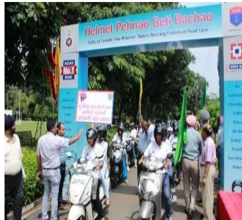
Helmet Rally Campaign