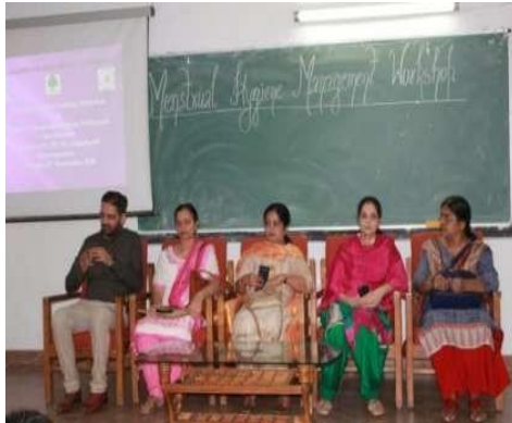
Guests of the Day