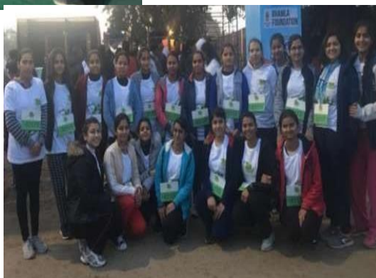
Participants in SBI Green marathon