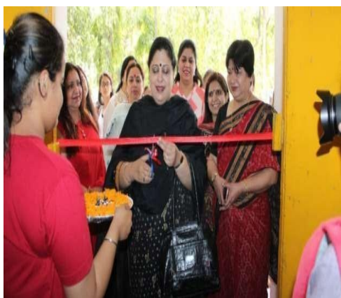
Inauguration of blood Donation camp

Blood donation camp was organized in PGGCG-11, Chandigarh collaboration with the Blood donation society of the college on 27 th March, 2019 . These camps were jointly organized by Blood Donation Society, NSS, Alumni Association and Department of Transfusion Medicine, PGI, Chandigarh. The staff and 87 students from the college donated blood with enthusiasm. All the NSS Programme officers were present in camp and motivate the students.