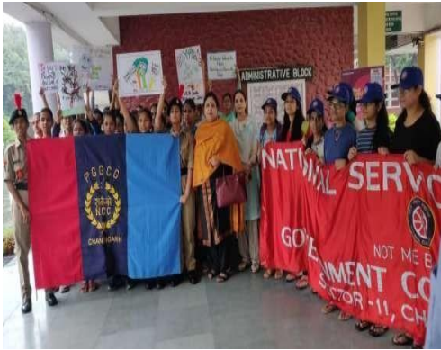
Posters on NSS day