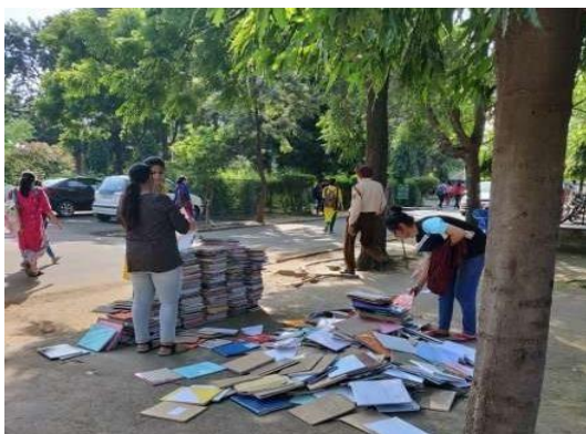
Collection of Books

A two-day Camp was organized by open eye foundation from 17 th & 18 th September, 2018 in PGGCG-11, Chandigarh. In this camp they collect books for needy students. 53 students of PGGCG-11 donated their old books for the needy students.