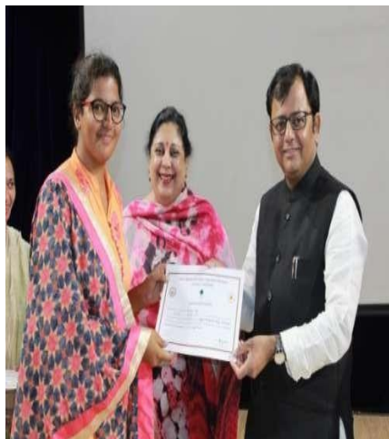
Mayor, Shri. Davesh Moudgil