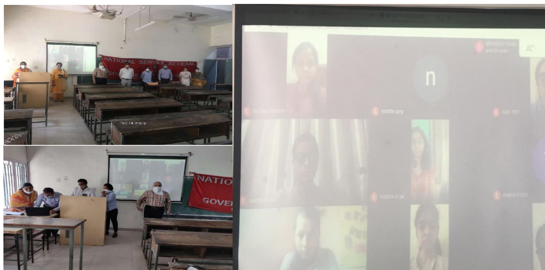
Online Pledge Students attending onlinemeeting

On 8 th October, 2020 Around 100 volunteers of NSS and Programme officers took a pledge to combat Covid-19 online. It was pledged that everyone would be vigilant and take the necessary precautions to prevent the spread of the deadly virus. Volunteers also pledged to encourage people to wear mask, maintain social distancing, and wash hands so as to win this fight against Covid -19.