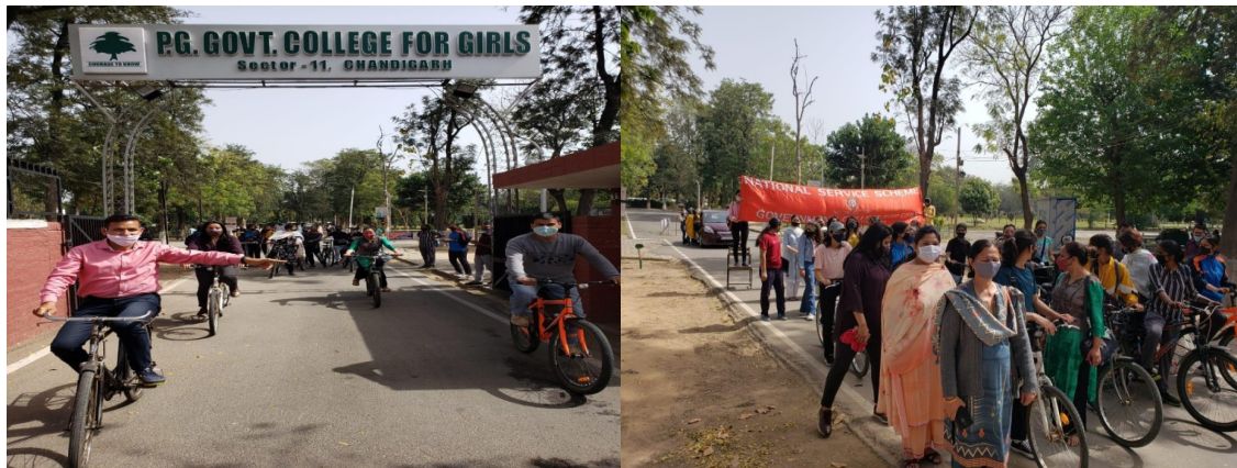
Volunteers during Cycle rally