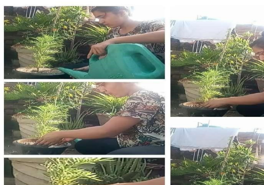
Planting a sapling