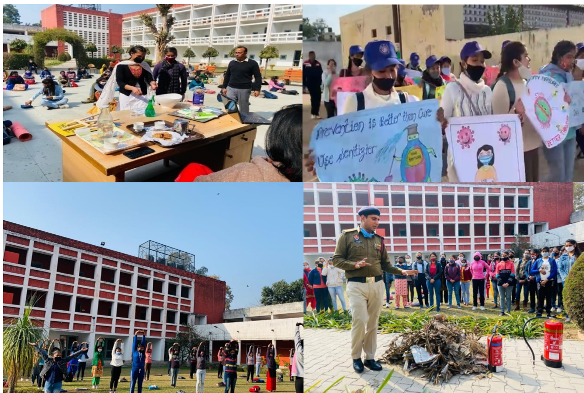
Participation of volunteers during the camp

National Service Scheme (NSS) with its motto-“NOT ME BUT YOU”, reflects the essence of democratic living and upholds the need for selfless service and helps the students in developing a sense of appreciation for others and show consideration towards other living beings. The camp was from 1 st February to 7 th February, 2021 with the theme “SWACCH BHARAT ABHIYAN AND JAL SHAKTI ABHIYAN”. Volunteers were full of enthusiasm as the camp was post Covid 19. The registration took place, Yoga session, Team from GMC sec-16, Visit to Khudda Jassu, , distribution of Masks.