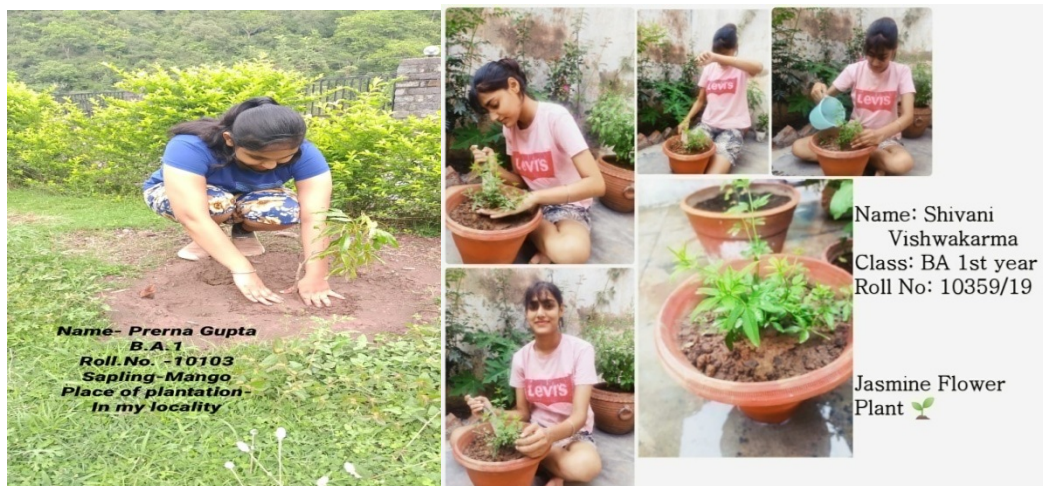
Plants were planted by students and uploaded a picture

On 11 th July, 2020, VanMahotsav is celebrated every year in the campus but due to the spread of the pandemic the volunteers were asked to celebrate it online. Around 120 students of the NSS unit of PGGCG 11, planted trees or plants around their surrounding and uploaded the pictures of the event. They also gifted plants to their friends.