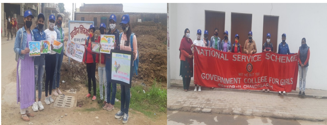
Volunteers at Khudda Jassu

The drive was undertaken by NSS volunteers on 31 st January, 2021 . They went to the village (KhuddaJassu) and took out a rally. They made posters and created awareness about sanitation. They also raised the slogans.