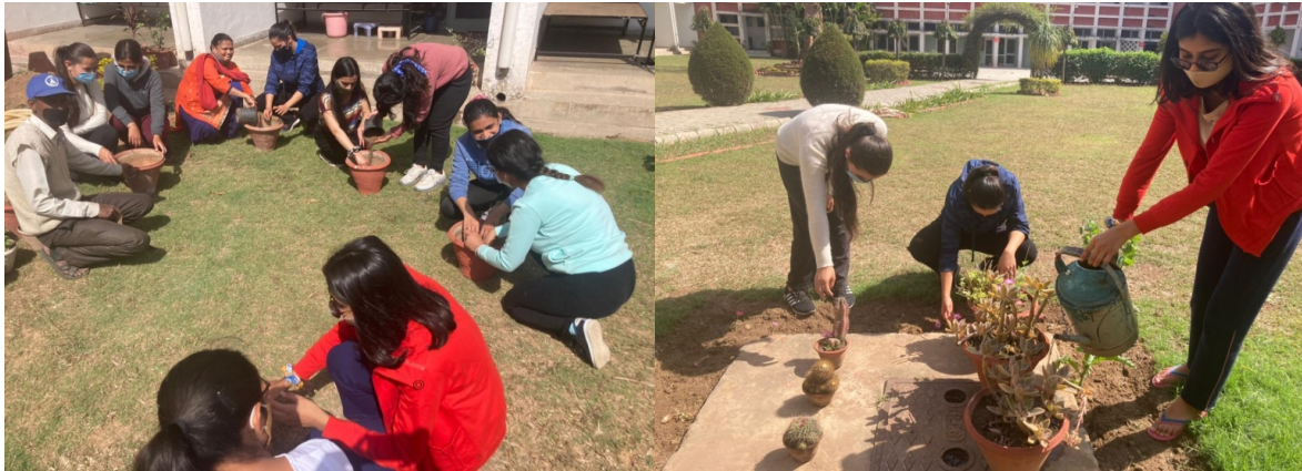
Saplings were planted by volunteers

On 11 th February, 2021, tree plantation was done in hostel premises. 40 Volunteers participated and planted plants in the pots. They enthusiastically did the plantation drive, Mrs.Karun Lekha guided them and they took a vow to continue it.