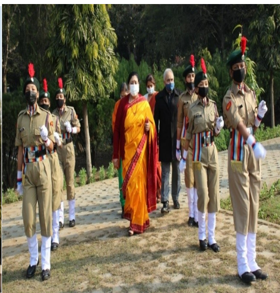
Principal reaching for Flag Hoisting