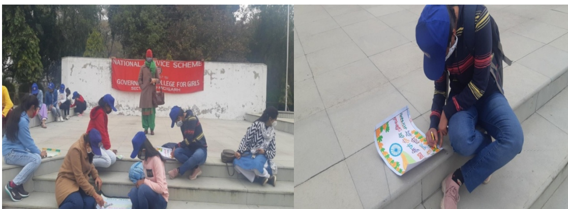
Posters Being Made by students

On the first day i.e 29 th January, 2021 Poster Making took place. Volunteers participated enthusiastically as they coming after a long time during Covid.