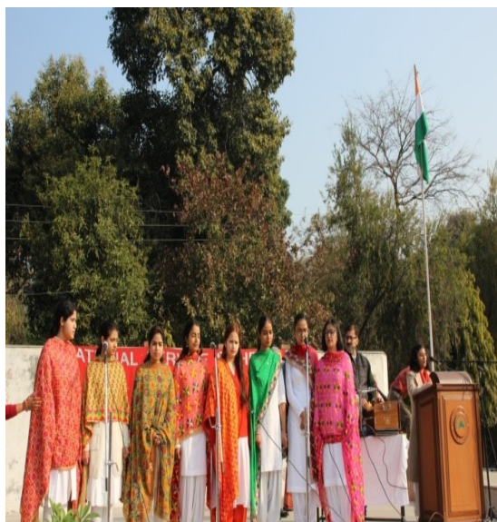
Song presented by the Students