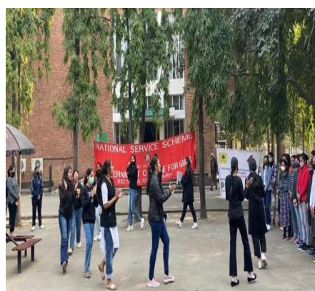
Registration Desk for NSS Volunteers