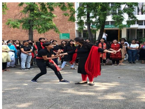
Performance of the NSS volunteers on Nukad Natak