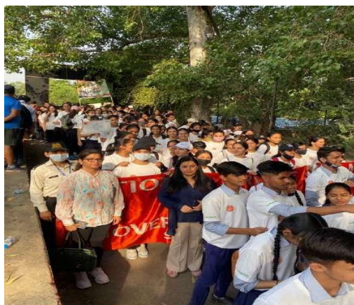
Volunteers at Sukhna Lake

On 15 th May, 2022, 60 volunteers walked through various landmarks of Chandigarh from 6:00 am onwards. Food Safety Administration, Health Department, U.T. Chandigarh geared up for a mass awareness campaign of safe, fortified and healthy eating without wasting food through Walkathon from Rock Garden, Sector-1, Chandigarh and Eat Right Mela at Sukhna Lake Club. The notion behind such an event was to spread awareness among citizens regarding the significance of three aspects related to healthy living.