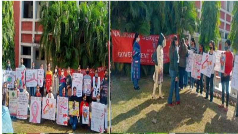
Posters made by the students

On 15 th December, 2021 The NSS Unit of the college organised a poster making competition on World AIDS Day where students actively participated with immense zeal and enthusiasm and made very beautiful posters. It was a great opportunity to watch these young minds trying to create their ideas of a better learning through posters.