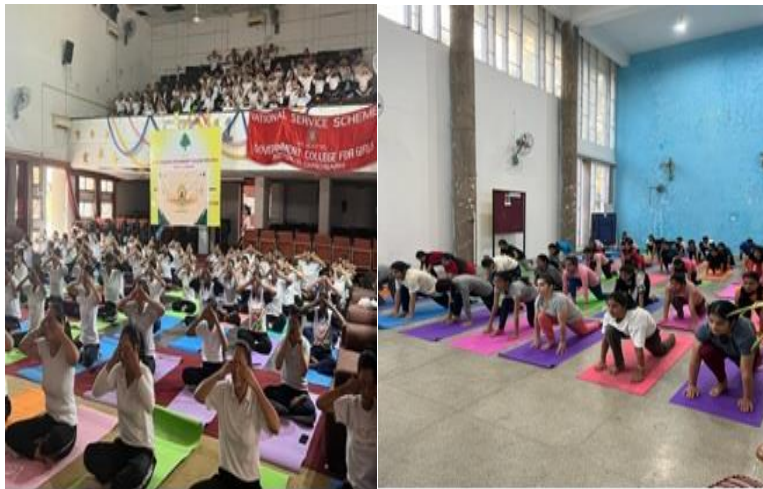
Volunteers performing Yoga asana on Yoga Day

On 21 st June, 2022 , 130 NSS volunteers with Physical education department celebrated the International yoga day. The main objective of this activity was to promote relaxation, reduce stress and improvement in medical condition such as premenstrual syndrome, blood pressure, anxiety and many more.