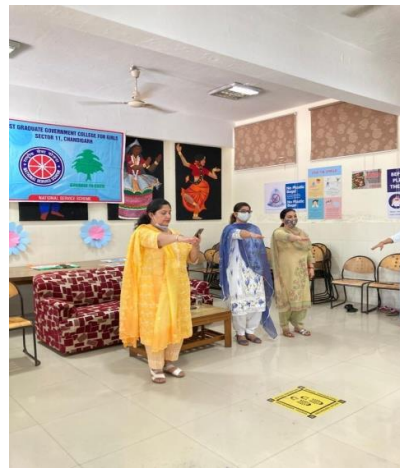
Pledge taken on NSS Day and Tree plantation in the Hostel Campus