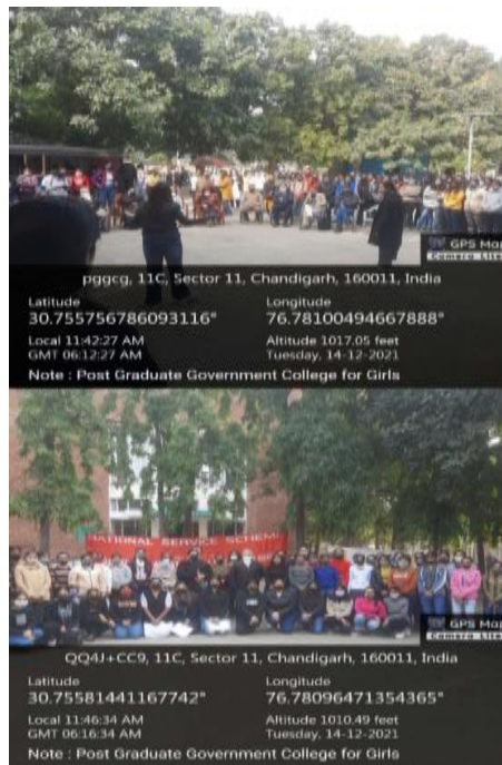
Nukkad Natak in the college Premises