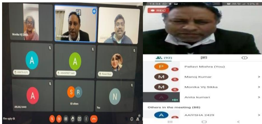
Participants attending the webinar