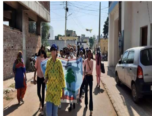
Rally at Khudda Jassu