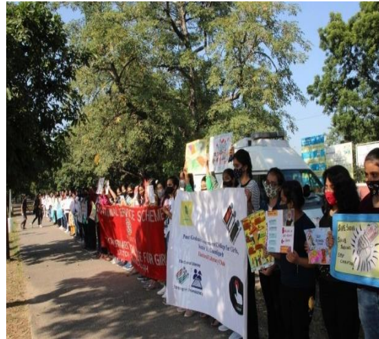
Slogans Presented by Volunteers