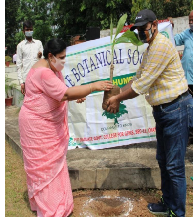
Plantation Drive: Principal and NSS Volunteer