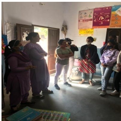
Volunteers at KhuddaJassu