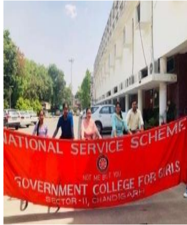
Participants during the cycle rally

On 2 nd June,2022 cycle rally on World Bicycle day was organized to draw attention to the benefits of using the bicycle-a simple, affordable, clean and environmentally fit sustainable means of transportation. 40 volunteers participated in this rally.