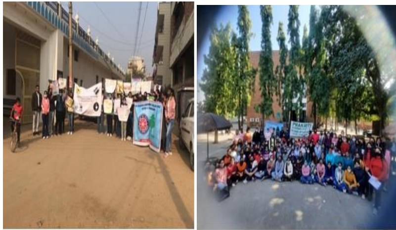
Rally at Khudda Jassu and Slogan raising