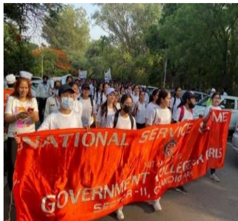
Mass awareness by Volunteers