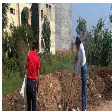
Cleanliness Drive at Khudda Jassu