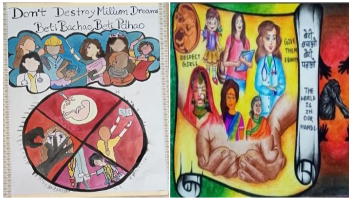
Posters on the theme Beti Bachao Beti Padoo