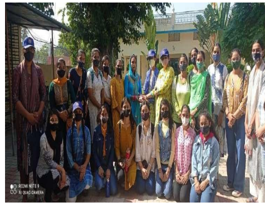
Volunteers visited Khudda Jassu