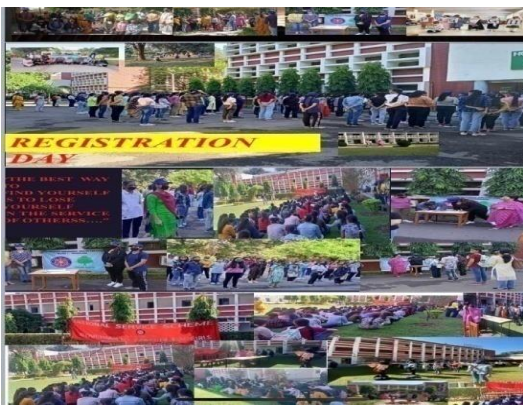
Registration on the first day

NSS seven days camp commenced from 19 th October, 2021 to 25 th October, 2021. The theme of the camp was 'Swachh Bharat Abhiyan'. It was started with the registration of the volunteers and 150 students were registered. A range of outreach and extension lectures were taken place on various subjects. Students participated in cleanliness drive in the college and at Khudda Jassu, they interacted with the villagers and educated them on the significance of the cleanliness. They also participated in a variety of competition.