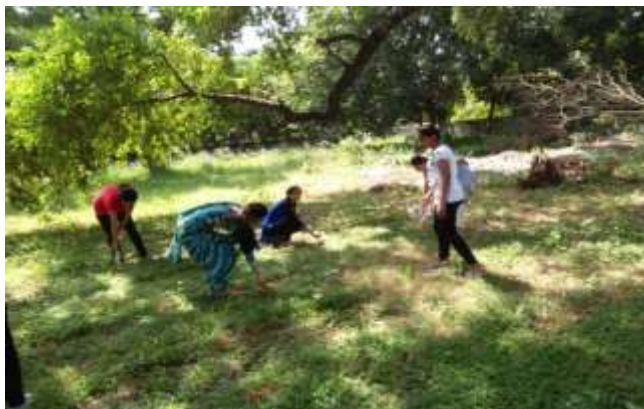
Student members of “Prakriti” during cleanliness drive

Student members of “Prakriti”- The Environment Society of Post Graduate Govt. College for Girls, Sector-11, Chandigarh celebrated campus cleanliness day on Teachers Day on 05 th September, 2017 in collaboration with Botany department. The Celebrations were marked by cleaning campus area and conducting tree Plantation Drive by the students as a tribute and expression of gratitude to their guiding light, their teachers. The function was attended by faculty members, members of Environment Society and students. Principal Dr. Anita Kaushal said that through such plantation drives, more and more people can be inspired to promote the importance of being at harmony with the environment. As many as 60 saplings of various ornamental, medicinal, avenue and Shade loving trees like Hibiscus, Amaltas, Baheda, Ashoka, Arjun, Kikar and Neem were planted in various areas of the College. 43 students and 15 faculty members actively participated in the event.