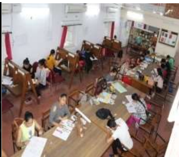
Inter College Slogan Writing Competition