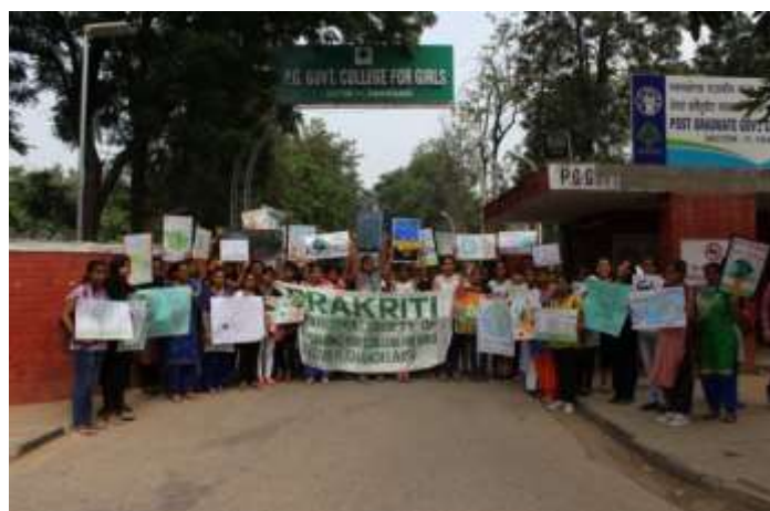
Student members of the Society during Ozone Day

“Prakriti”, the Environment Society of Post Graduate Government College for Girls, Sector-11 Chandigarh celebrated “World Ozone Day” on 16 th September, 2017 . The function started with the formation of Human Chain by the faculty and the student members of the society. This Human Chain terminated into a rally by the student members within the college campus and surrounding areas of the college. The students were carrying placards bearing slogans and messages like “Save Ozone”, “Stop Use Of Deodorants and Perfumes”, “Save Ozone Save Earth”, “Reduce The Use Of CFC’s”, to sensitize people about the depletion of Ozone layer and the harmful effects of UV radiations on human beings. This rally was flagged off by the Vice Principal Mr. Kanwar Iqbal Singh and senior members of the Faculty, Vice Principal emphasized that Sustainable Development was the need of the hour. He appreciated the efforts of the society members and applauded their constructive role for the betterment of the society. About 38 students along with the faculty members also took a pledge to preserve the ozone layer by decreasing the use of Chlorofluorocarbons.