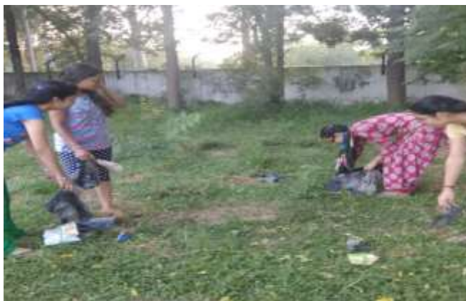
Student members of “Prakriti” during cleanliness drive