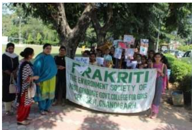
Student members of Prakriti during rally inside the College