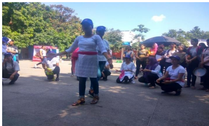
Nukad Natak by student members of the Society