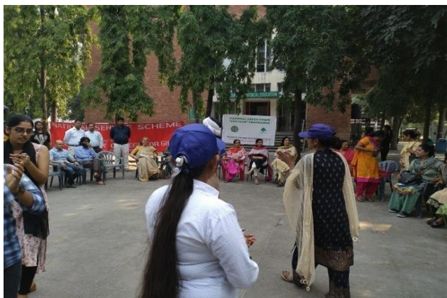
Nukkad Natak by students of Prakriti

About 25 students of Prakriti and NSS presented two Nukkad natak depicting hazards of bursting crackers, the effect of crackers on old people and children, increase in the noise pollution and air pollution and sensitized the students not to burst Crackers but light diyas and observe a green and ecofriendly Diwali. About 95 students participated in the event. On this occasion a human chain was formed by about 100 students carrying placards with slogans like Say No To Crackers, Celebrating Diwali With Diyas And Crackers, Have A Eco Friendly Diwali, Burst Ego Not Crackers, Safe Diwali Green Diwali, etc