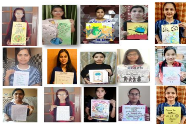
Participants holding the Slogans