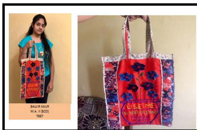
Entries for Bag making Competition

About 39 graduate and post graduate students from different streams participated in the events. Entries were saved in Google drive and sent to judges for Judgment.