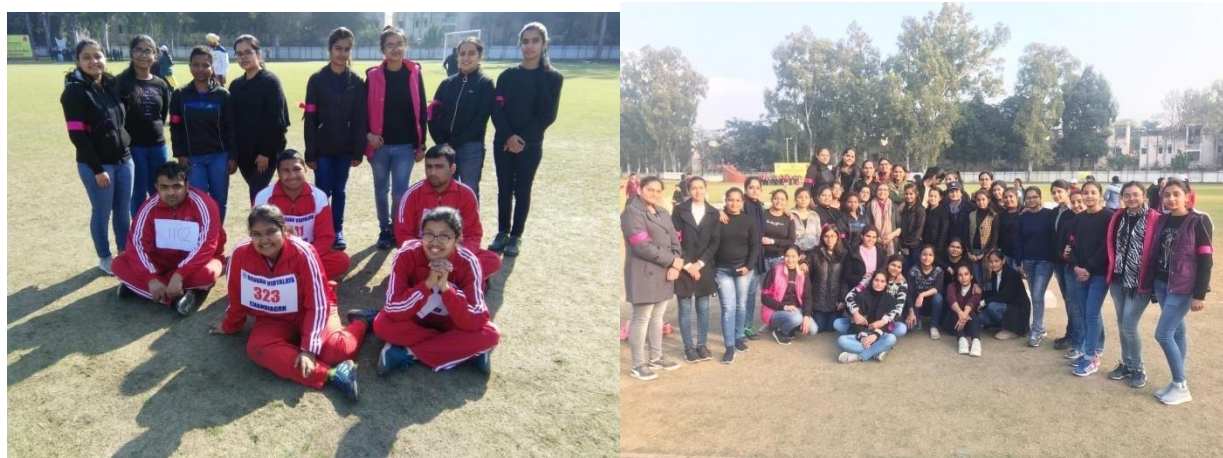
Student members of Prakriti volunteering for Special Olympics

About 40 student members of Environment Society volunteered for Special Olympics, an Athletic event organized for approx. 400 mentally challenged students from Chandigarh and adjacent areas. It was 3-day event 30 th January to 1 st February, 2020 . The girls volunteered with great dedication and enthusiasm. The volunteers gave their best in helping out these especially abled children made them comfortable and they were there to boost their confidence during the various athletic events. They also helped the organizers in serving refreshments keeping records of various events and prize distribution on the concluding day. The students were awarded with appreciation certificate for the same. The students and faculty members were thankful to respected principal.