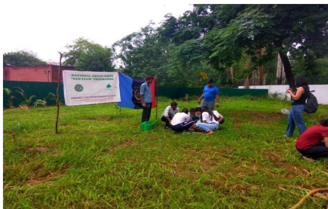
Students of Prakriti and NSS Planting Tree Saplings

Prakriti-The Environment Society of Post Graduate Government College for Girls, Sector 11, Chandigarh in collaboration with NCC organized a tree plantation drive as a part of Vanmahotsav celebration on 26 th July, 2019 . As many as 51 students of environment society and NCC participated in the drive. They planted saplings of fruit trees, avenue trees and medicinal trees like Gauva, Jamun, Amla, Kadam and Neem in the open area of the New Hostel. These saplings were sponsored by NCC unit-01-Girls Battalion. The coordinator of the Environment Society and Incharge of NCC encouraged the students for adopting the trees and taking post plantation care and thereby protecting the Environment.