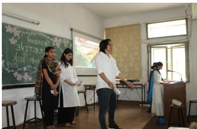
Team Students during group task on water conservation

Group task on water conservation: In Group task each team member very vividly explained water crises and provided various solutions to conserve water. As many as sixteen Post Graduate students of various streams participated in group task and explained the prevalent water crises in India and also gave solutions how to overcome. About 48 students participated in the events.