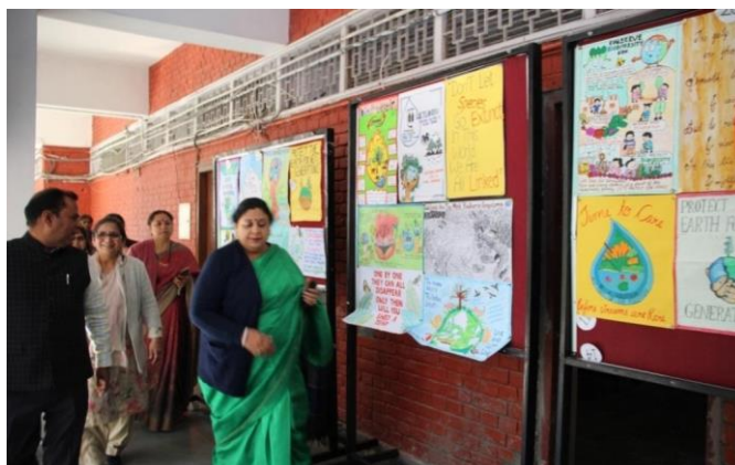
Chief guest and Principal Viewing Posters and Slogans