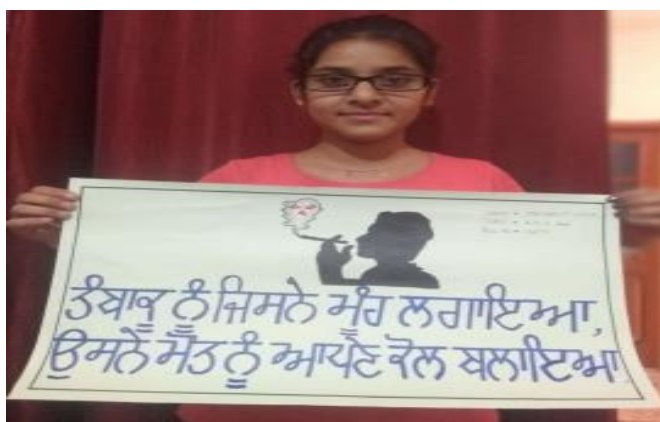
Participants while holding their slogans