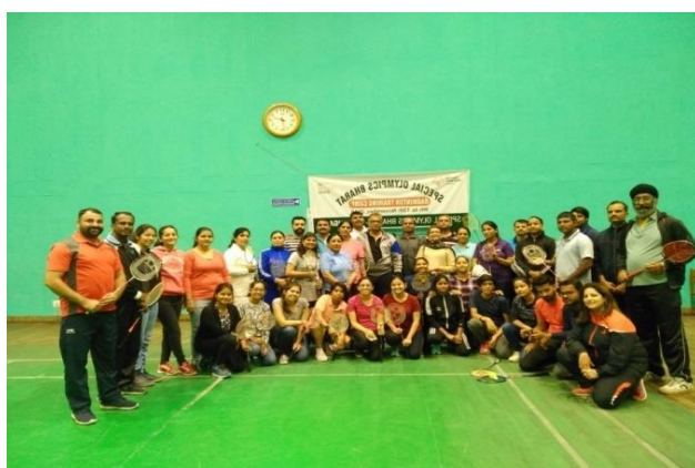
Student members of the society during practice session