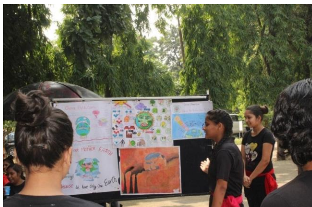
Poster Display on Ozone Layer depletion