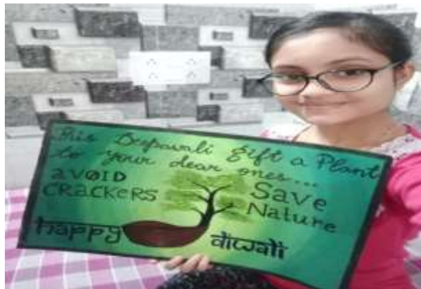
Student during awareness campaign