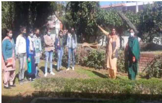
Staff with the students