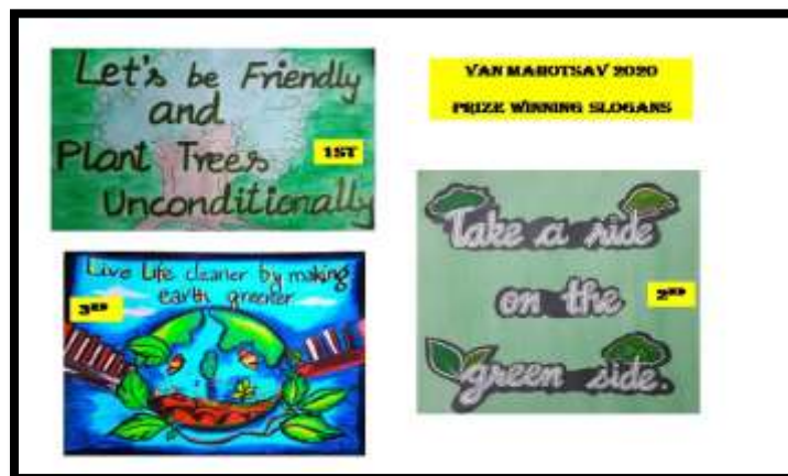
View of Posters

On 20 th August, 2020 about 100 students from different colleges of tricity participated in the Inter College Competitions. About 50 students participated in the slogan writing competition, 25 entries for photography Competition and 15 entries for just a minute contest.