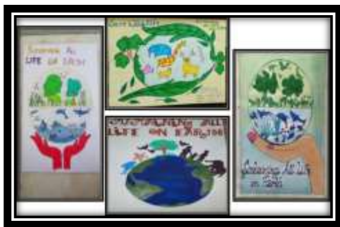
View of Posters and Slogans made by the participants

Documentary On Wildlife Conservation (2 nd Oct 2020): On the first day of week i.e. 2 nd Oct 2020 a documentary on wild life conservation “Wildlife Predators” was shown to students of the society during online meet to sensitize them about the importance of wildlife for a sustainable environment. Link of the documentary was: