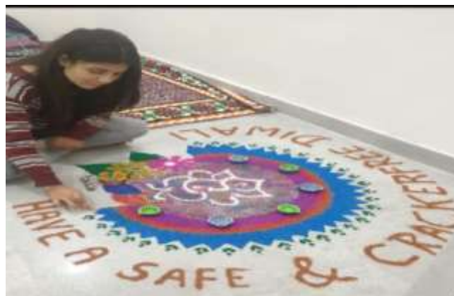
Student making rangoli with decorated diyas