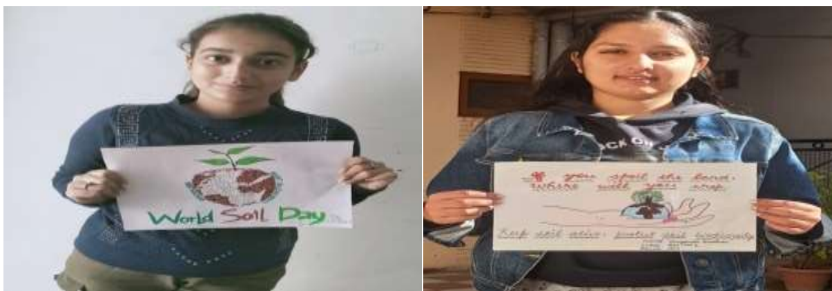
Students with their Posters

About 50 students participated in the competition. A Talk on soil conservation was delivered online by Monika, Student of BSc II NM. Online Pledge was also administered to students during classes to improve the soil health.