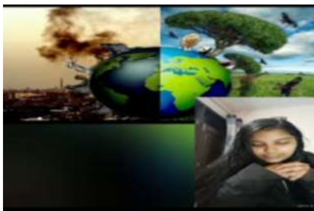
Students during just a minute contest