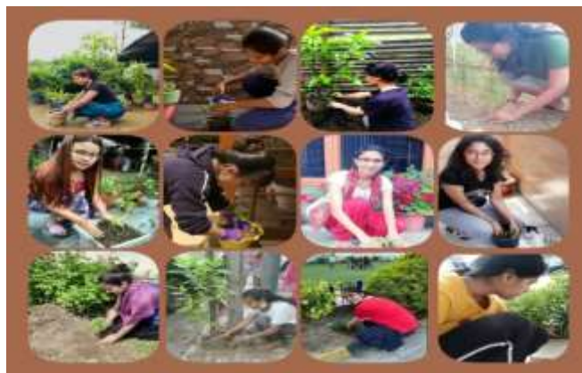
Students planting the saplings