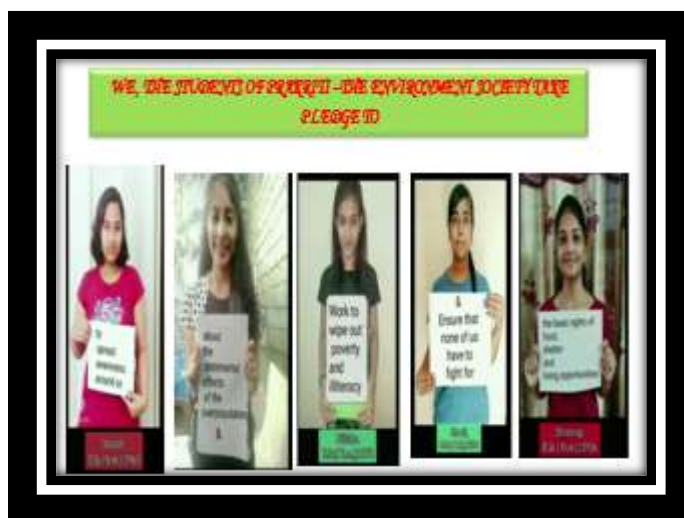
Student members while taking pledge on World Population Day