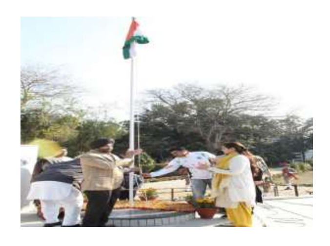
Republic Day Celebration