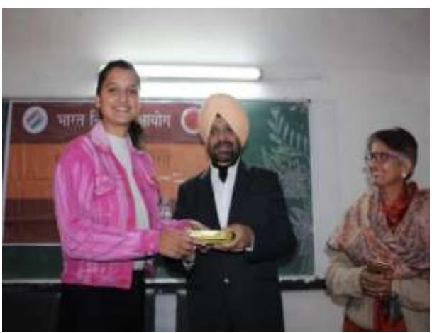
National Voter's Day