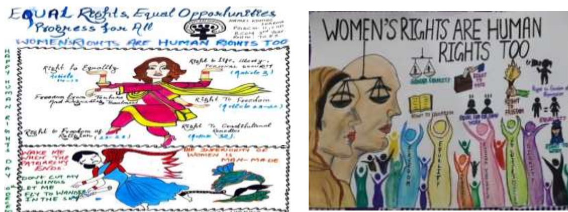
Poster Making Competition