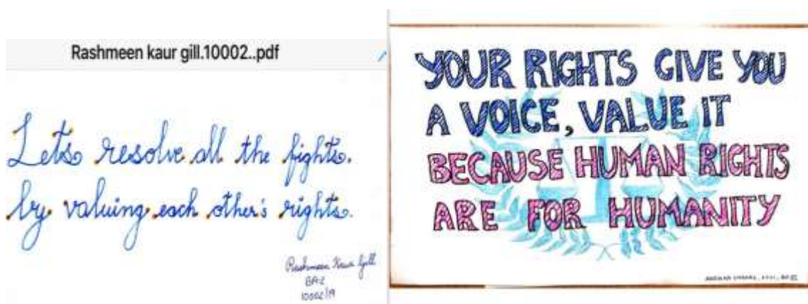
Slogan Writing Competition

Prashasnika organised 'Slogan Writing Competition' and 'Poster Making Competition' to commemorate World Human Rights Day on 10 th December, 2020 . The competitions were open to classes of all streams and the participants were allowed to write in Hindi, Punjabi and English Medium. Students evinced keen interest in this event despite Covid-19 and participated enthusiastically online by writing slogans and making posters to highlight the significance of human rights. The entries covered diverse aspects relating to the importance of human rights, role of National Human Rights Commission, history of reforms pertaining to human rights in India and women centric human rights issues.