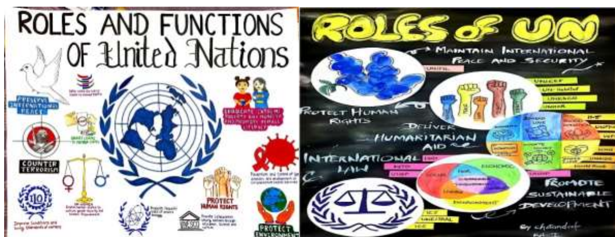
UN Day Celebration

Students participated in the contest enthusiastically and presented their creative and imaginative potential in a vivid manner. The entries covered all the aspects and were not only related to the UN's importance, its working and contribution to the world, but also reflected the suggestions put forth by the young generation, to further strengthen and improve the body.