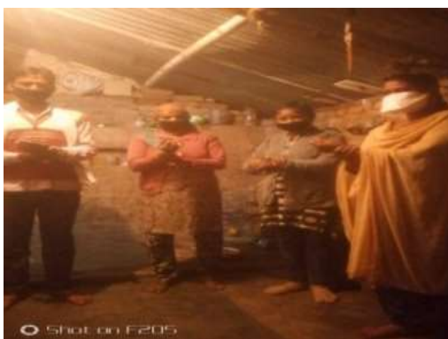
Off-campus activity on Parakram Diwas