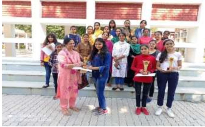
Head of the department distributing the prizes to the prize winners