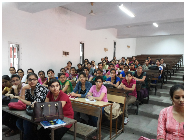
Students attending the orientation programme