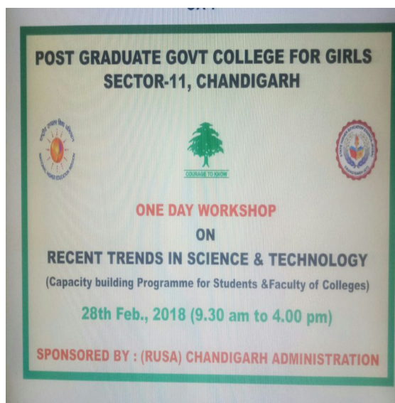
Banner of one day workshop

Department of Chemistry, Post Graduate Government College for Girls Sector-11, Chandigarh, organised one day capacity building workshop on 28 th February, 2018 , Under the aegis of RUSA. in the college on the topic “Recent Trends in Science and Technology”, Resource persons were selected and invited on the basis of their expertise knowledge and experience in the required field. About 40 faculty members and 100 UG, PG and Hons. students from the college participated in the workshop. It comprised of three sessions including inaugural session.