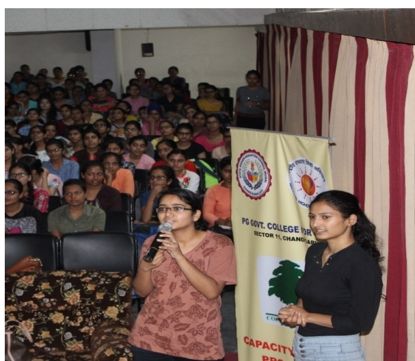
Students attending the workshop