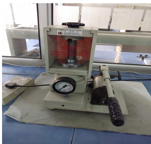
Hydraulic Pellet Press

The students of M. Sc. I and faculty members of Chemistry department attended one day workshop on Instrumentation Techniques in Chemistry organized by the Department of Chemistry of GGDS College, Sector 32 on 6 th March, 2018 . The workshop comprised of five lectures and demonstration of various instruments used in chemistry. 21 students attended the same.