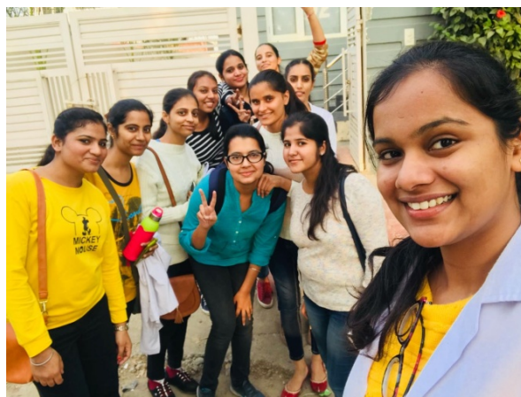
Students at CSIR-CSIO

On the occasion of 75 years completion of CSIR in Indian Science and marching towards a strong knowledge as a part of CSIR platinum jubilee Celebrations, CSIR-CSIO organized a Mega Science Exhibition for three days on 30 th October to 1 st November, 2017 at CSIR-CSIO sector 30 Chandigarh. MSc (II) chemistry PGGCG, Sector-11, Chandigarh along with their teachers attended the inaugural function of the exhibition and was made aware of research opportunities. Our organization has been under adoption program of CSIO. 21 students and 02 faculty members attended the same.