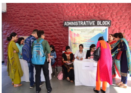
Registration by faculty and students