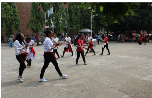
Nukkad Natak in Open Ground of College