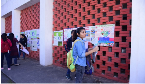
Display of posters