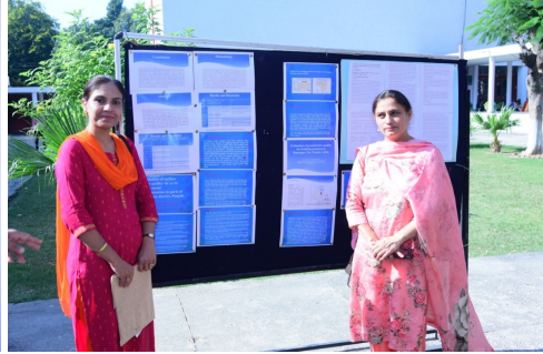
Display of posters by faculty