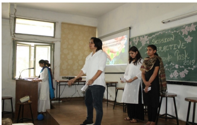
Team of students during group task on water conservation

Prakriti – The Environmental Society of PGGCG – 11 organized various events as a part of “Jal Shakti Abhiyan – 2019” being observed by the Ministry of Human Resource Development(MHRD) under “Swachta Pakhwada 2019” 1 st September to 12 th September, 2019 under Prime Minister’s mission “Jal Shakti Abhiyaan”. The theme for the same was water conservation and making India free from single use plastic. Around 70 students participated in the same.