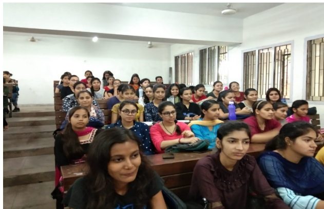
Students Participating In Orientation Programme