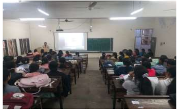
Students Participating in Quiz Competition