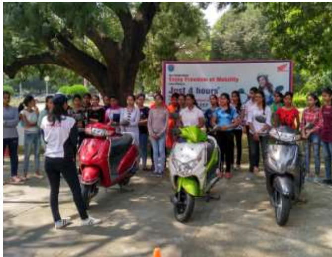
Guidance on stand on/off & safety measures

Traffic Awareness and Road Safety Society, in collaboration with Chandigarh Traffic Police and Honda Pvt. Ltd organized a Female safety riding workshop on 19 th September, 2017 at Children Traffic Park, Sector 23, Chandigarh. 42 student members of the society visited the park along with the teacher in-charges and learnt the nuances of riding two-wheelers. Guidance on daily inspection, acceleration, correct braking, importance of helmet, riding gear and riding posture, stand on/off practice were part of the training program.