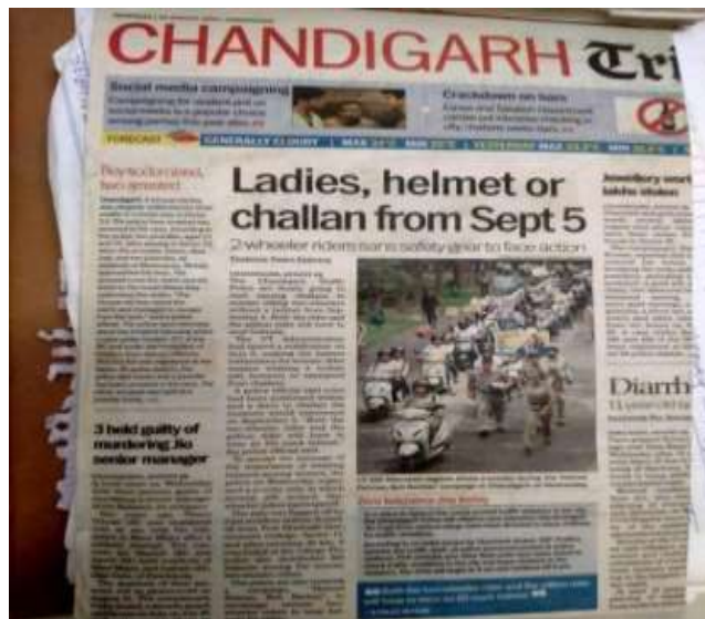
News paper report of the event

The Traffic Awareness and Road Safety Society of Post-graduate Government College for Girls, Sector-11, Chandigarh, along with NSS and Traffic Police, Chandigarh organized a scooter rally on 29 th August, 2018 as part of the 'Helmet Pehnao, Beti Bachao' Campaign, to spread the message of spreading awareness regarding wearing Helmet among female riders. The rally was, as an extension activity consisted of around 50 scooter riders flagged off from the premises of PGGCG-11, Chandigarh and culminated at PGGCG-42, Chandigarh. Helmets were also distributed among the participants. Twenty students participated in the activity. The rally aimed at spreading awareness in the public as well as student community and routed through the main roads. It was greatly appreciated and cheered on by passers and the Chandigarh Traffic Police.