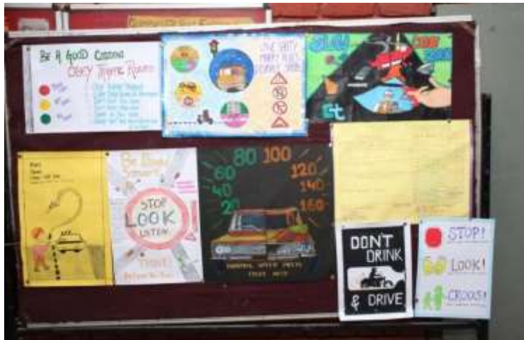
Display of Slogans made by the participants