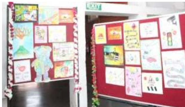
Display of Posters