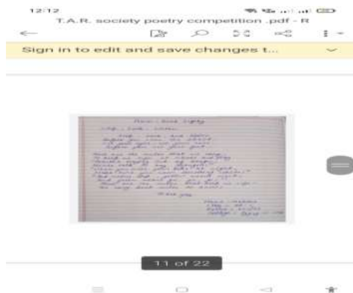
Poem written by a participant on road safety

An Online Mono Act Play, Poetry Writing and poster making on the theme “Road Safety Norms in Pandemic Times” on 10 th July, 2021 was organized to sensitize the students. The student members participated in great numbers i.e.76 and made their contribution through videos regarding wearing of masks while on road and maintaining distance when they go out of their house and also to follow Covid-19 restrictions issued from Chandigarh Administration or their residing state from time to time.