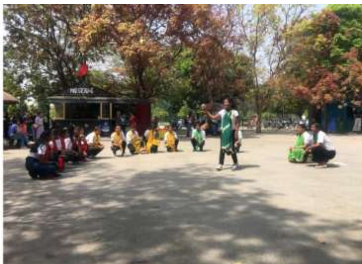
Street play being performed by students

The Traffic Awareness and Road Safety Society, in collaboration with Department of Public Administration organized a Street play “Zara dekh ke chalo” on 31 st March, 2022 at 12.15 pm in the college premises near Nescafe in which 21 students played their role and more than 200 students viewed the Street Play. The Street Play sensitized the students on the significance of safe and cautious driving. Through the performance and presentation, the students were made aware of the hazards of drunken driving, helmetless driving, red-light jumping etc. It was highlighted that life is very important, and most of the times ego, vanity, misuse of mobiles, show-off and over-confidence becomes the cause of accident. It was further stressed that the rate of road-accidents has gone higher in India. It is noteworthy that if one avoids high-speed driving and carelessness on roads, and follow traffic rules most of the accidents are avoidable. The students were highly motivated by the actors of the play and placards were distributed to the audience consisting of both teachers and students who were present in great numbers.