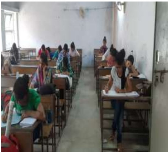
Participants during competition