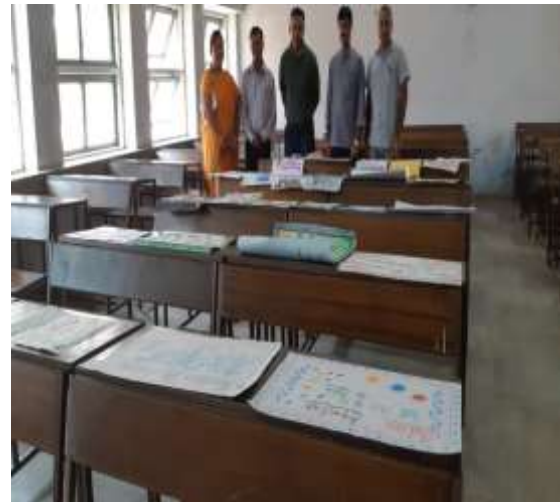
Layout of posters & judgement