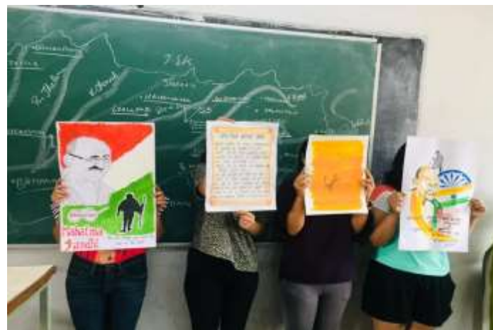
Display of Poster by students