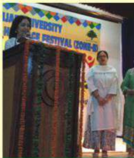
Mrs. Kirron Kher, Member of Parliament, as the Chief Guest during inaugural session of Inter Zonal Youth Festival