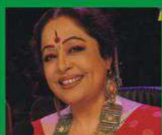
Mrs. Kirron Kher - Member of Parliament

“ The young alumni should be equipped with knowledge in order to take on the world and also to shed their inhibitions, not to be afraid of failures and live the life to the fullest.”