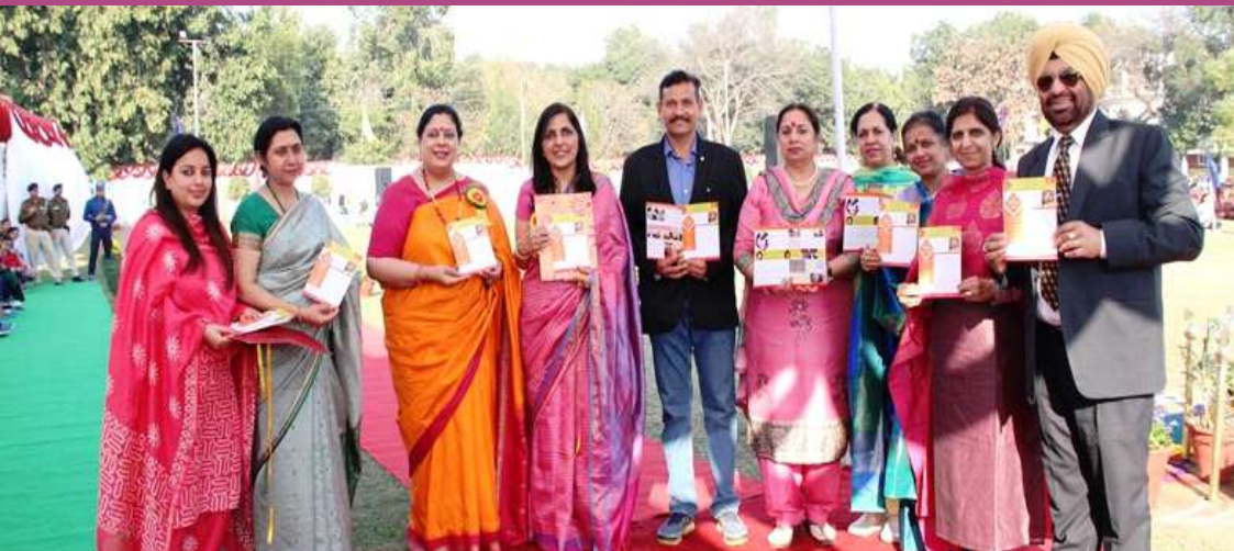
Release of Annual Newsletter- Vol. 05 on 15th February, 2020