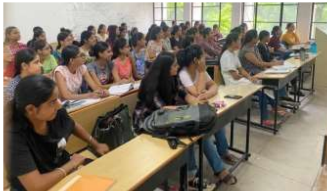
Seminar on Career Guidance and Higher Studies

On 3 rd September, 2019 a seminar on Career Guidance and Higher Studies was held. A career guidance seminar was conducted. In the seminar, the expert explained to the students the need to make an informed career decision and the various factors that play a role in it, namely Aptitude. The career guidance session focused on helping students and parents understand the importance of career guidance and counseling and understand the process of career guidance for their growth. The session focused on helping the students and parents break the myths around career counseling and learn about how career counselors and counseling can support their growth. The participants cleared their doubts and understood more about the career counseling process. They were then introduced to the concepts of career counseling and what it would entail. They understood that instead of parents just blindly making decisions for children without understanding their aptitude, personality and interest, could cause difficulties in their future personal and financial growth. Interest and Personality. It was organized by Infomaths, Chandigarh and 85 students from BCA Department had attended the seminar.