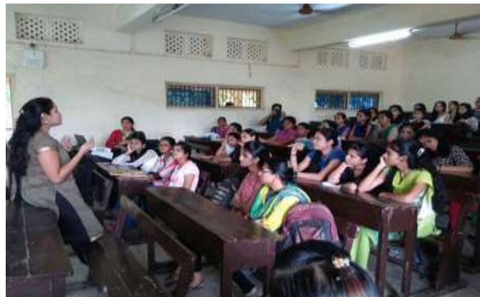
Awareness Seminar on Competitive Exam

A seminar regarding IT and competitive exams was organized in the department by M/S Infomaths Studies Pvt. Ltd. on 28 th August, 2018 . The resource person began the session by stating that today the students have lot of openings for prospective career in government sector, corporate sector. Competition is getting tougher day by day and the doorway into the best of the academic institutes is just not straightforward. It requires a lot of hard work, dedication and most importantly, consistent efforts. The reality of tough competition can be seen through this data. The Purpose of any competitive examination is not just to judge one's talent but also to test an individual's management and planning skills. The resource stressed that rigorous training, systematic planning and hard work are the keys to face the entrance exams. He finally concluded by stating that the exams are tough but not impossible to crack. Speaker through presentation enlighten around 120 students of BCA department about public and private sector opportunities.