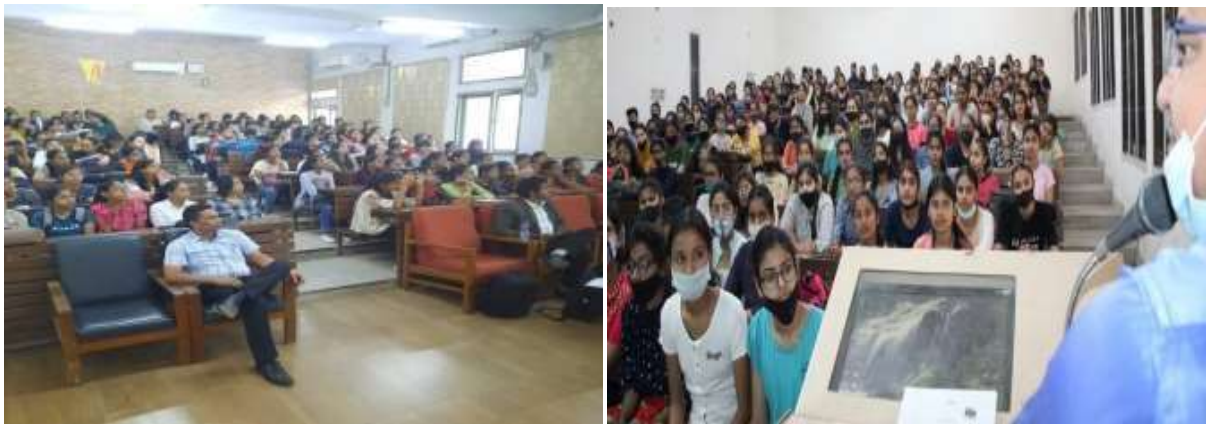
Two Day Workshop on Python

A Two-day workshop on Python was conducted by Nidus Technologies, Chandigarh for students of BCA 6 th semester and M.Sc. 2 nd semester from 10 th to 11 th February, 2020 . Python programming is powering the global job market because the benefits of Python are clear. Python is a general-purpose, high-level, remarkably powerful dynamic programming language that is used in a wide variety of application domains. Python supports multiple programming paradigms, including object-oriented, imperative and functional programming styles. Python is one of the top three programming languages in the world. Python programming is a general-purpose skill used in almost all fields, including Data science. 80 students from BCA and M.Sc. attended the workshop.