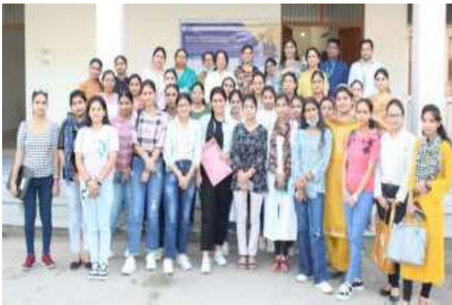
Students Participated in Campus Placement

A Placement drive was organized by infinity Technologies IT Park Panchkula for the jobs of Business Developers Executives and Web Developers. On 30 th August, 2018 . Placement drive was organized for the final year graduation students of various streams. Main objective of the placement drive was to identify the talented and qualified students in the college who are suitable for the current job roles without any biased behavior. It was also to ensure students start a career and move forward in the right direction for better quality living. Placement drive conducted different rounds like preliminary technical, HR and final interview. More than 100 students took part in the placement drive and showcased their technical and verbal skills.