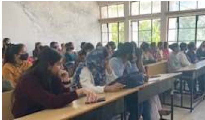
Student from BCA-III year expressing their Views on Women Empowerment

8 th March, 2022 is celebrated as International Women's Day. It is a global day celebrating the social, economic, cultural and political achievements of women. To celebrate this day, the Department of Computer Applications had organized an Open House on women-centric theme. Students of BCA participated in the event in which they openly spoke up on various topics as: Women empowerment, Gender Equality, Break the bias etc., which clearly showed the focus to gender inclusion and women's empowerment. The event was organized under the aegis of Azadi ka Amrut Mahotsav.