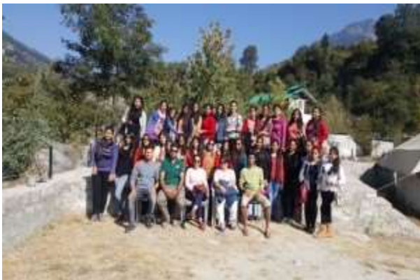
Faculty Members of B. Com and BCA with students

The Department of Commerce and Computer Applications jointly organized an educational cum adventurous trip for the students of B. Com and B.C.A. from 23 rd October, 2017 to 27 th October, 2017 . Around 60 students from both BCOM and BCA had visited different places like Manali, Salon valley, Manikaran Sahib, Kullu. Overall, the trip was quite helpful for grooming the personality of the students filled with fun and frolic. Manikaran. Manikaran is famous for its hot water springs emerging at various locations along the Parbati River. The students relished ‘Langar’ which is prepared in this boiling water only. The heat near the boiling place, where the meal is cooked, is so high that in-habitual persons cannot even stand and tolerate the heat for some minutes. The students were very excited for the trip as it was their first-time experience of camping. After a long journey of approx. 10 hrs, they finally reached their destination, The Highlander Camp.