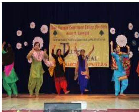
Students performing dance during IT Fest