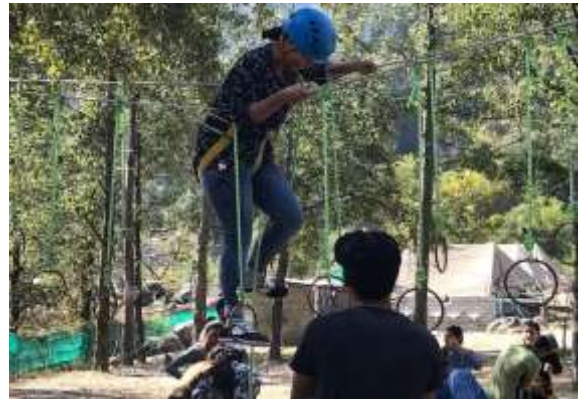
Students during Adventures