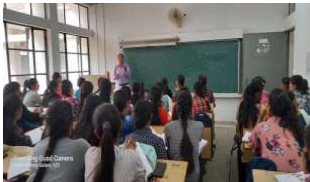
Resource person explaining the concept of Vedic Maths with BCA Students