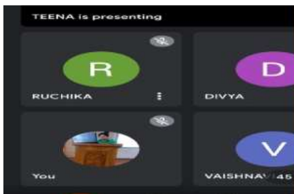
Virtual IT Fest (Tech-Zeal)

PG Department of Computer Applications of Post Graduate Govt. College for Girls, Sector- 11, Chandigarh organized virtual IT Fest-Tech Zeal on 28 th May, 2021 . Students from various colleges from Chandigarh and Punjab had participated in different events like Montage, Show- Case, impromptu, Web Createx and got positions. The event was successful enough to attract as many as 34 team's registrations for a one-day event making it an event attended by more than 34 students.