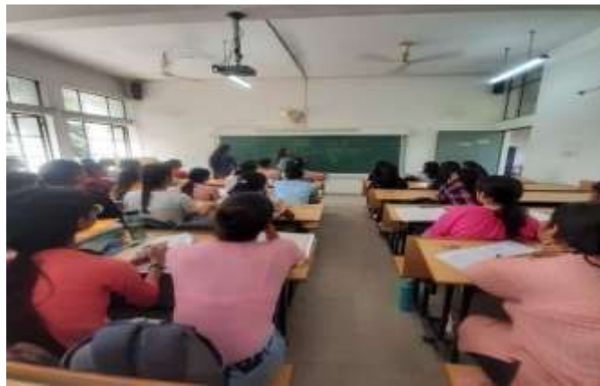
Resource Person interacting with Students

Infomaths Institute Chandigarh held workshop on Vedic Math's for the students of BCA and PGDCA courses on 20 th August, 2018 . The resource person of the institute deliberated upon various techniques for easy calculations and remembering the formulas. Vedic Maths is an excellent tool for developing interest towards numbers and making calculations a fun. The resource person also shared the brilliance of Vedic mathematics and taught few tricks to the students to calculate faster and with accuracy. The resource person gave various examples and in hand practice to the students to grasp the tricks spontaneously. Students showed keen interest in the knowledge imparted by the resource person and participated in the workshop with zeal and enthusiasm. It enables faster calculation as compared to the usual method. It promotes mental calculation. It gives students a better understanding of mathematic. Vedic math improves the spiritual side of the child's personality. The workshop was attended by 150 students and also it was of immense benefit for them.