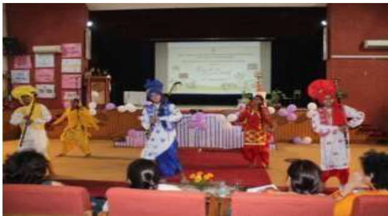
Students performing Bhangra during the Fest