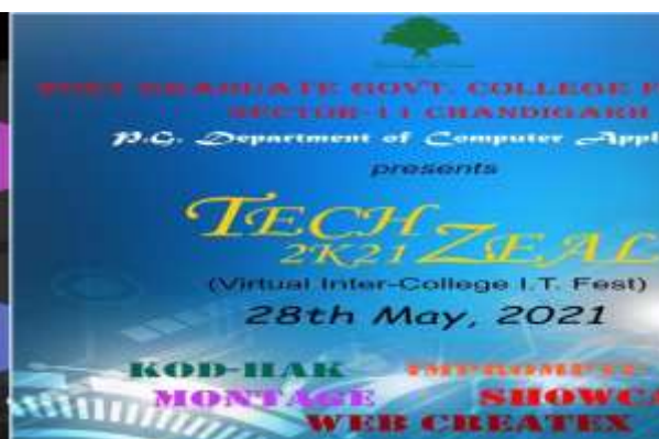
Virtual Tech-Zeal Invitation