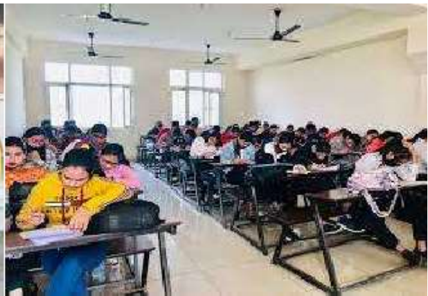
Students during Preliminary Round