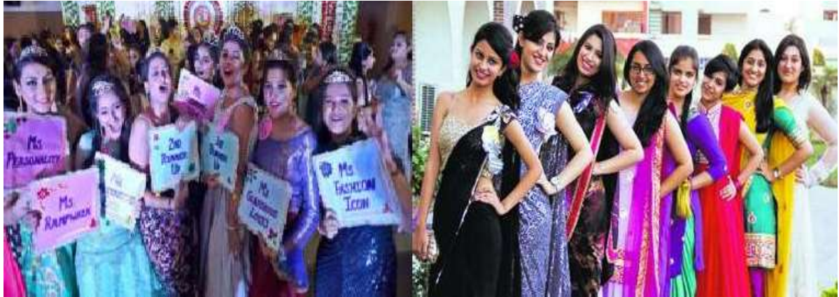
Students of BCA-I Participating in Freshers' Function

A fresher's party was organized by the senior students of BCA for the BCA first year students on 19 th September, 2019 . The students danced on a medley of songs which was enjoyed thoroughly by the audience. Solo song performances were also highly applauded by one and all. A group dance left the audience swerving on their feet. Around 180 students and faculty members enjoyed the show and showered their praises on the students performing on the stage.