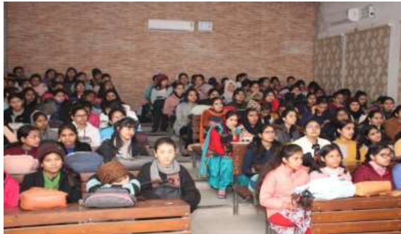
Workshop by UCREATE IT PVT. LTD.