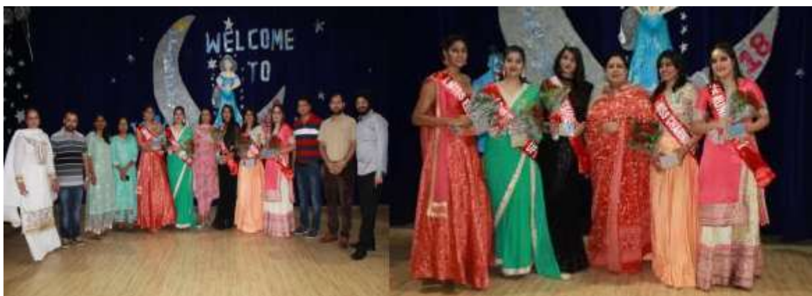
Madam Principal & Faculty of BCA Department with Winners