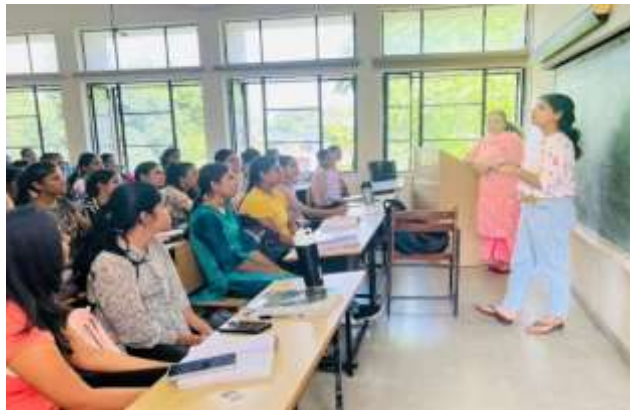
Workshop on Vedic Maths

M/s Infomaths Institute Chandigarh held workshop on Vedic Maths for the students of BCA and PGDCA courses on 18 th August, 2017 . The resource person of the institute deliberated upon various techniques for easy calculations and remembering the formulas. The interactive sessions during the workshop helps in their mental exercise, thus improving the mental arithmetic skills. The workshop ensures that the participants acquaint themselves with the magic of Vedic Maths and learn formulas and tricks that help solve complex mathematical problems with ease. The workshop was attended by 170 students and also appreciated by the students as it was of immense benefit for them.