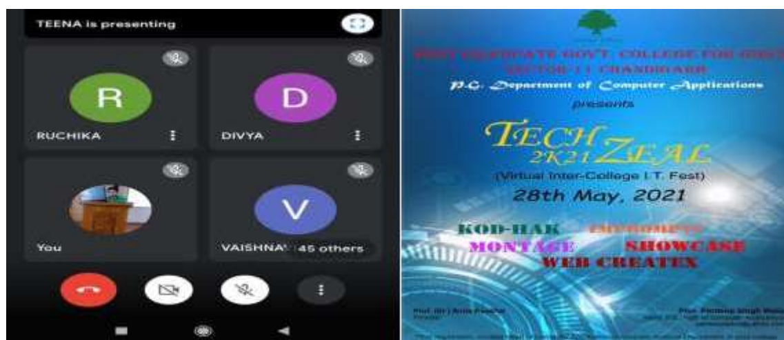
Students Presented online during Virtual IT Fest