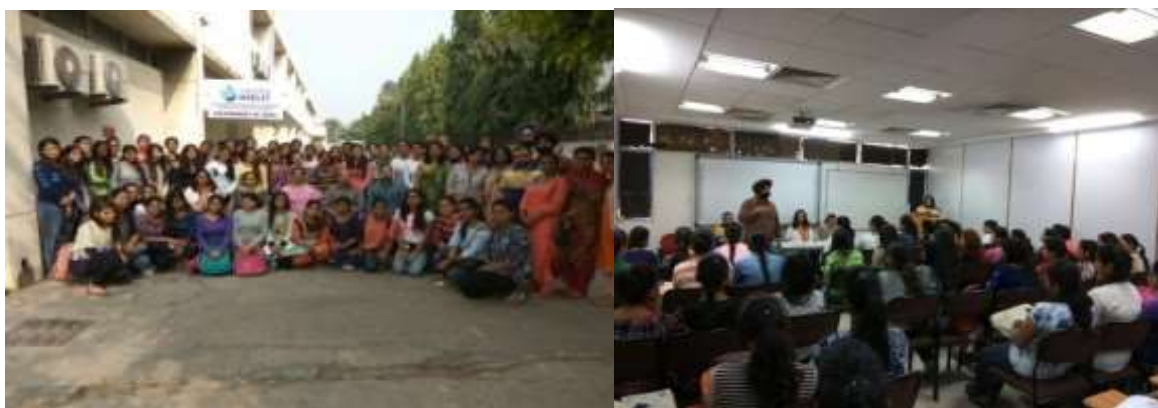
Faculty of BCA Department with Final Year Interactive Session with students

Department of Computer Applications organized an industrial visit for the students of BCA and M.Sc.-IT at National Institute of Electronics and Information Technology (NIELIT), Mohali on 8 th November, 2017 . Total 50 students visited the institute and were welcomed with a brief interactive session about the advancements in the field of technology. The visit concluded with a small introduction about the Bigdata technology and its various applications in the technology world. The technology has contributed a lot in home automations, known as Domotics. After the session, the students proceeded for the networking labs and server room to see the various types and working of network devices such as routers, switches etc.