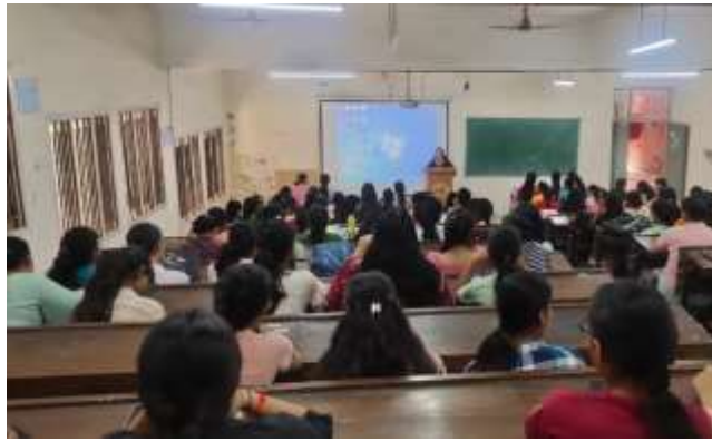
Talk on Career Opportunities

A Talk on different career opportunities after Graduation by Infomaths Studies Pvt. Ltd., Chandigarh was organised on 9 th February, 2018 for the students of BCA 1 st year and 2 nd year. Career talks provide information on various occupations within an industry. They introduce students to the nature and scope of the work done and educate them on the skills necessary to perform certain job functions. The Career Talks are also designed to excite and motivate young people about the career options and opportunities available to them. They made the students aware about the various courses and specializations in Information Technology which they can choose after graduation. Total 90 students from BCA-1 st and 2 nd year had attended the talk.