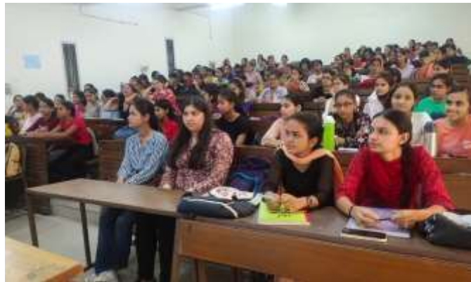
Workshop on Artificial Intelligence and Machine Learning

A workshop on machine learning was organized on 23 rd February, 2019 . An “intelligent” computer uses AI to think like a human and perform tasks on its own. Machine learning is how a computer system develops its intelligence. AI and ML are everywhere, from the corporate world to gaming stations, and perhaps, more than our regular lives, AI is impacting the business world more. Artificial intelligence describes a machine that is capable of imitating and performing intelligent human behavior. Some of these tasks could include problem solving and decision making or specific activities requiring acute perception, recognition, or translation abilities. One way to train a computer to mimic human reasoning is to use a neural network, which is a series of algorithms that are modeled after the human brain. The workshop was organized to enlighten the trends and opportunities in Artificial Intelligence and Machine Learning and around 100 students from BCA department had attended the workshop.