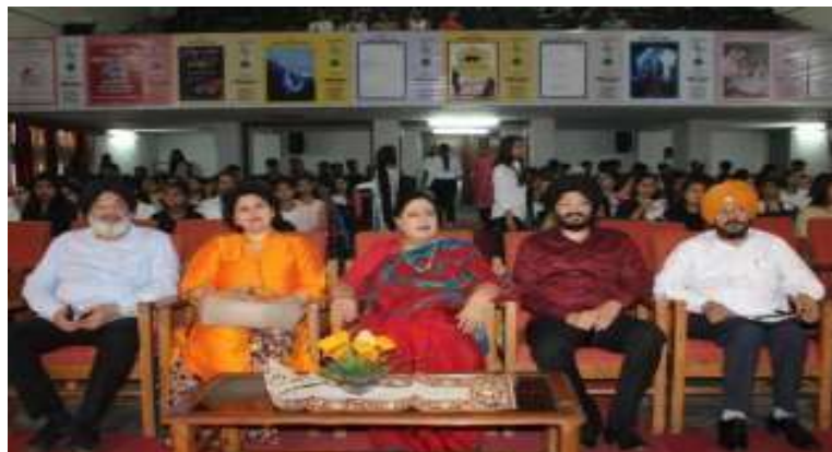
Principal Madam and Other Faculty Members