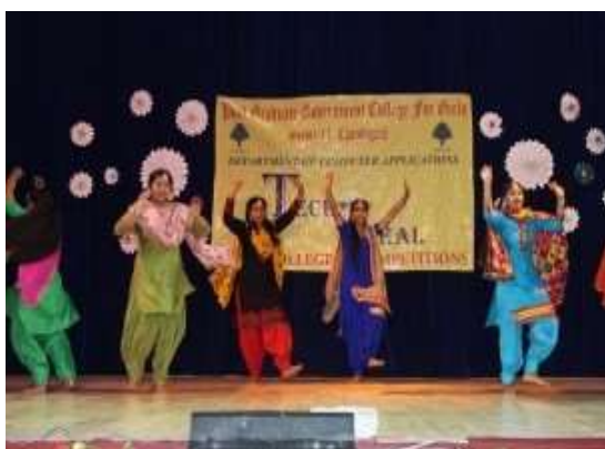
Students of our College Performing Bhangra