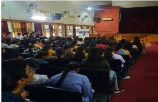
Story Telling Session on Product Development