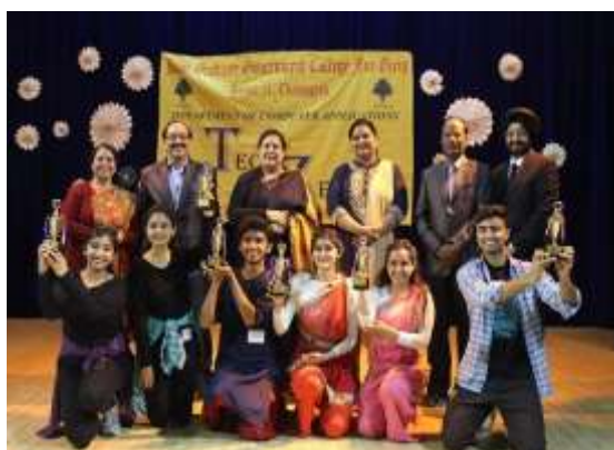
Winner Team with Madam Principal