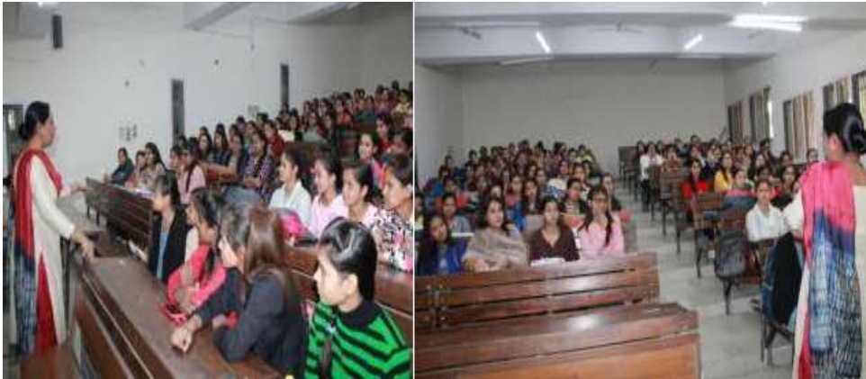
Resource Person Interacting with Students of BCA

A workshop on Data Network Security was organized on 14 th November, 2018 . The upsurge of computer networks and increased dependence on the Internet has brought in vulnerabilities in the systems connected to the network. Opponents pitch various types of security-related attacks to the organizations, thereby stealing and modifying their valuable information. There is a great need of understanding the various attack types, taking precautionary measures to counter them and protect our systems from malicious parties. The workshop was aimed to discuss the current trends and future of Information Security and Secured Programming. Around 90 students had participated in the workshop.