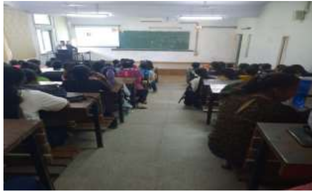
Workshop conducted by Bulls Eye