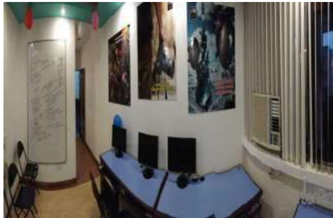
Zee Multimedia Labs

The students were taken on a field visit to Zee Multimedia labs, Sector 34, Chandigarh on 28 th November, 2019 . 60 students visited the institute which was established in 2003, Zee Institute of Creative Art. Chandigarh (also known as ZICA Chandigarh) is a premier institute of Creative Media and Design located in Chandigarh, Punjab. The Institute is part of the venture Zee Learn, backed by the parentfirms Zee and Essel Group. The Essel Group is one of India's strongest business ventures with assets in diverse fields such as Media, Healthy Lifestyle, Packaging, Technology, education, Infrastructure, PreciousMetals and Wellness. Several well-known brands which include Zee Network, Dish TV, DNA, Fun Republic,E-City, Asian Sky Shop and Essel World are owned by the Essel Group.