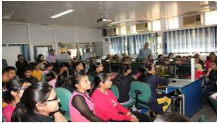
Seminar Conducted by Infomaths

A Seminar on “Introducing you to the world of AI” by Infomaths, Chandigarh on 25th January, 2021 . Artificial Intelligence is the ability to design smart machines or to develop self-learning software applications that imitate the traits of the human mind like reasoning, problem-solving, planning, optimal decision making, sensory perceptions etc. Artificial Intelligence (AI) is the branch of computer sciences that emphasizes the development of intelligence machines, thinking and working like humans. Concept of AI was elaborated in this seminar by giving examples of SIRI, TESLA, COGITO and NETFLIX. 85 students were very satisfied with this seminar and excited to gain enough knowledge about AI.