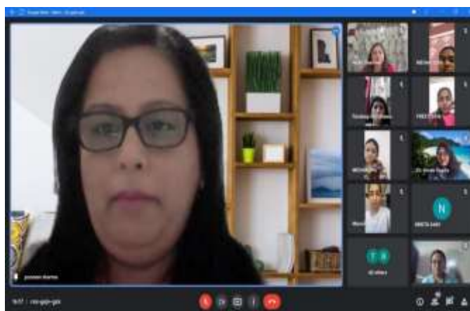
Speaker sharing her experiences and views