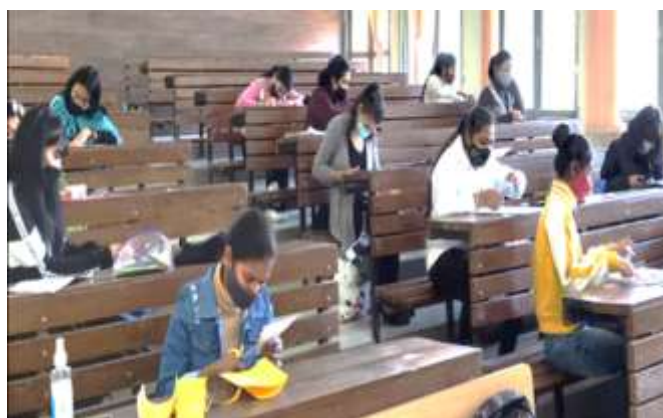
Students making the cards during the competition