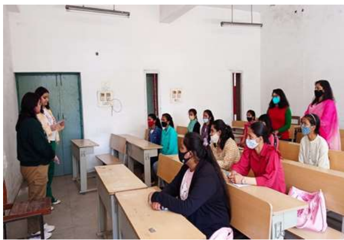
Students participating in open house discussion