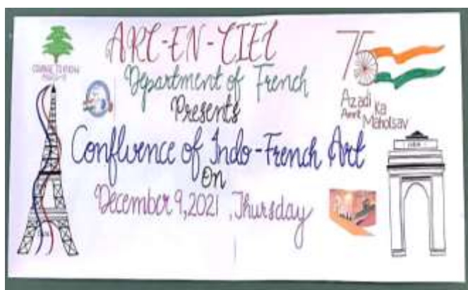
Poster of the event