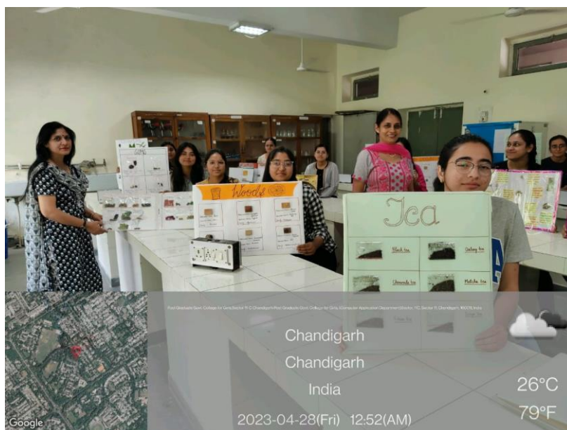
Students participating in the event

Botany Department of Post Graduate Government College for Girls, Sector-11, Chandigarh organized "Exhibition on Plant based products" on 21 st December, 2022 . Around 30 M.Sc. students participated in the exhibition in which various useful plants based products like fibres, gums, resins, legumes, spices, oils, herbal drugs etc. were displayed. Student's collections were very useful and informative.