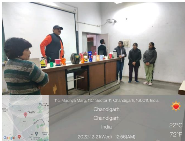
Judgement of Waste to Wealth competition