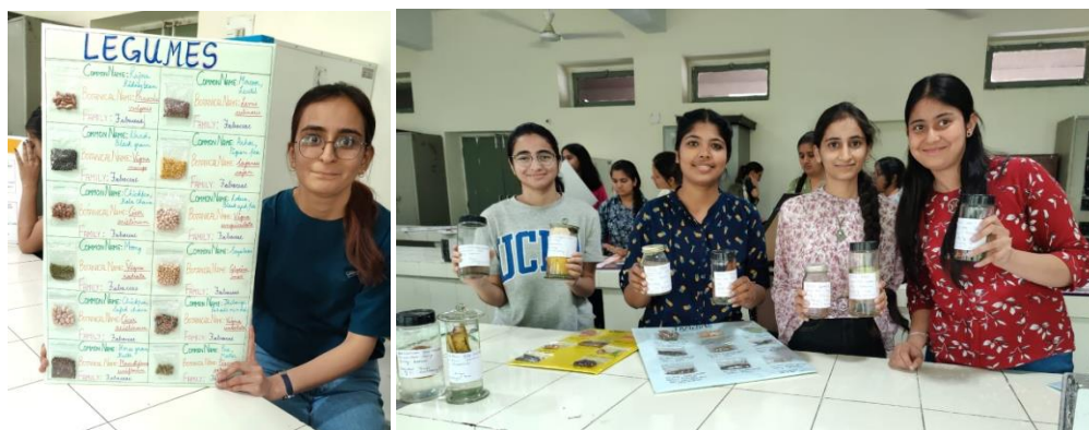
Students displaying their collections