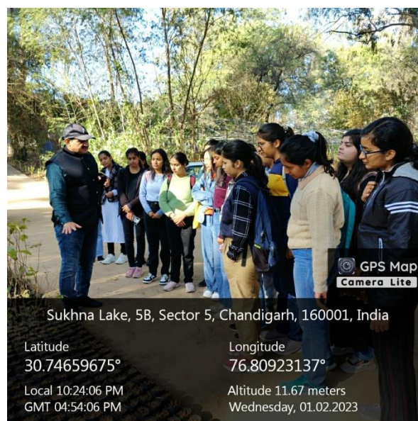
Interaction of faculty members with students