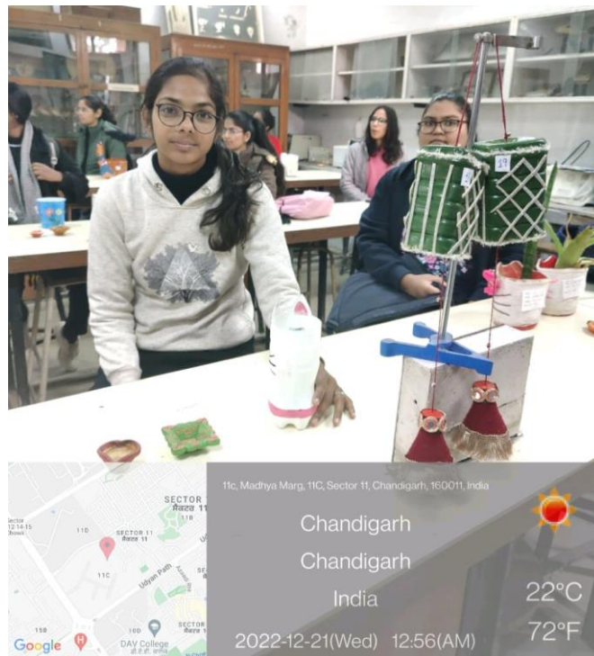
Participants displaying their products