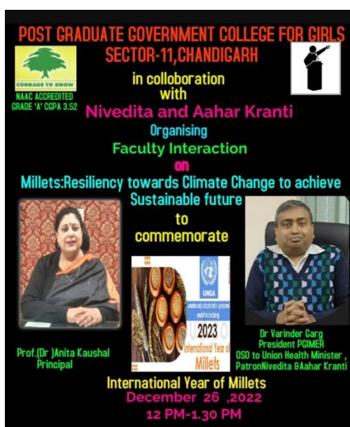
Brochure of the event