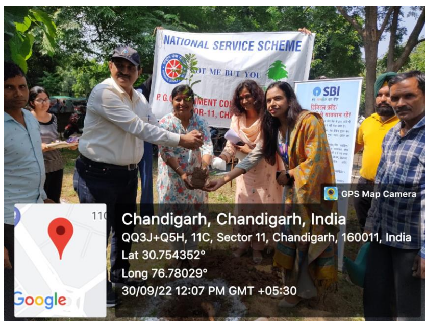
Faculty members and officials of SBI planting tree saplings